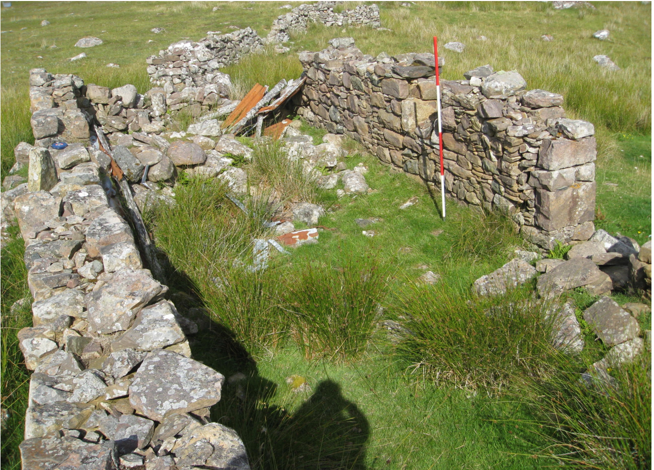
LOOKING DOWN ON RUIN FROM SW CORNER SHOWING GOOD WALL CONSTRUCTION.

RUIN ON CROFT 34 LONEMORE CROFTING TOWNSHIP NG 79020 77697 GPS