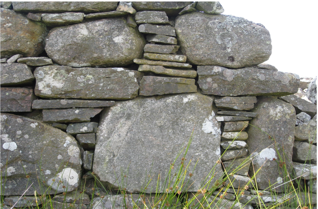
ILLUSTRATION OF DETAIL IN SNECKING IN WALLS