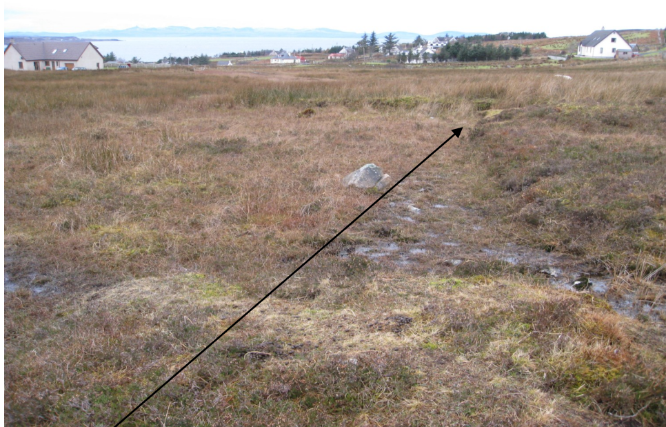
Old peat cuts on croft 34

The township head dyke runs along the N and E boundaries of the croft and there is a passage to the S. And E of the croft.