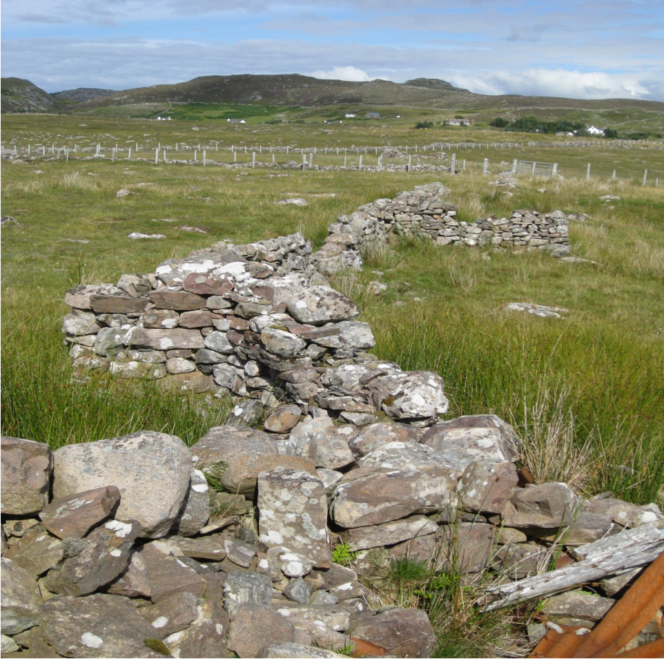
WALL EXTENDING N TOWARDS CROFT BOUNDARY

RUIN ON CROFT 34 LONEMORE CROFTING TOWNSHIP NG 79020 77697 GPS