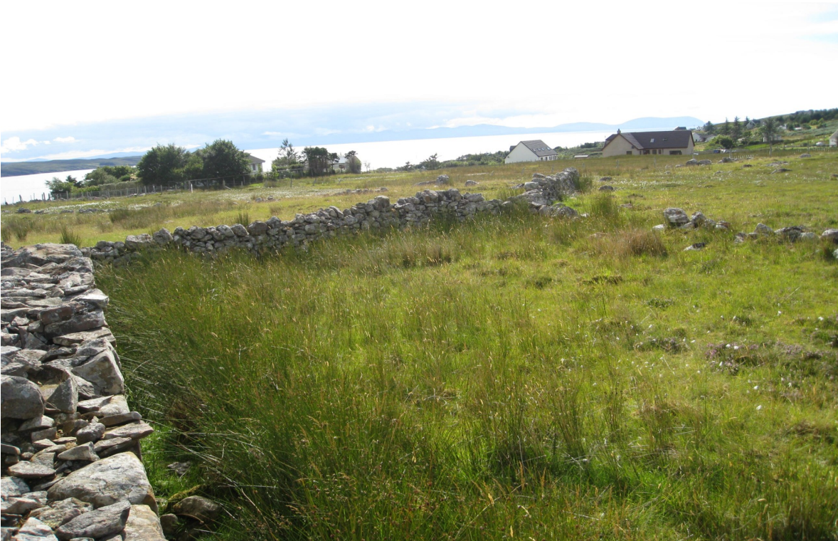
WALLS BEHIND THE RUIN ENCLOSING GARDEN AREA.