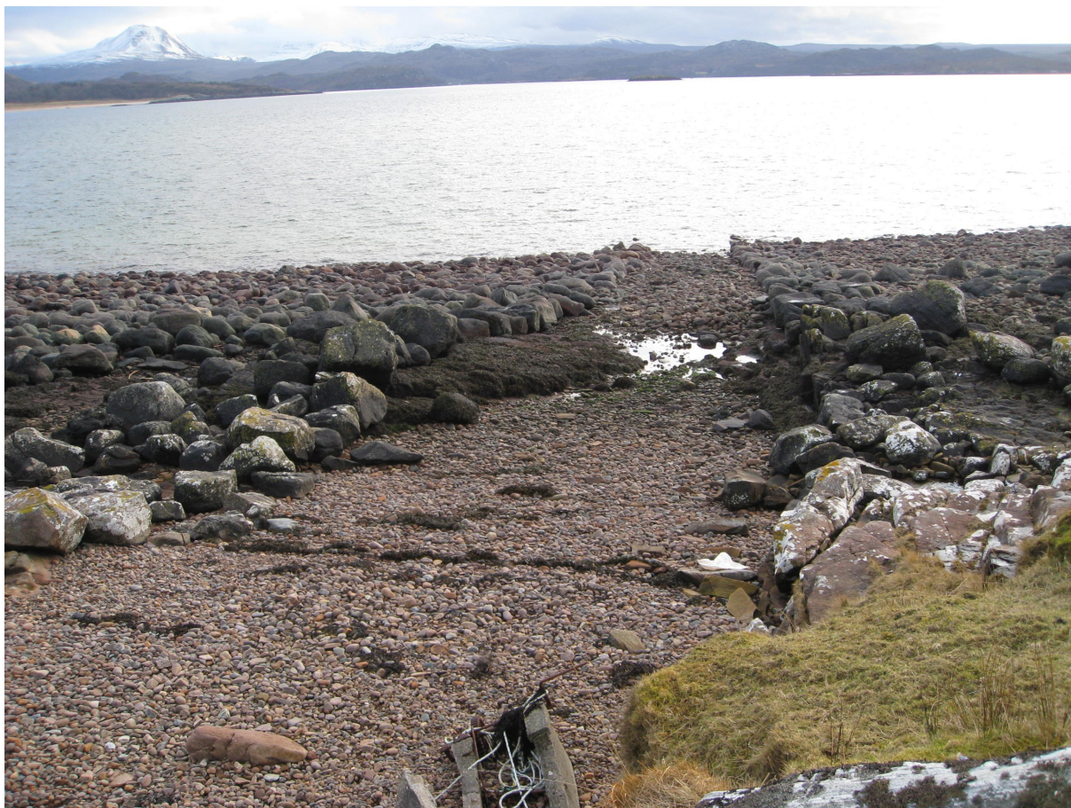
PORT AN LOIN MHOIR SHOWING CLEARLY MARKED SLIPWAY THAT CAN STILL BE SEEN