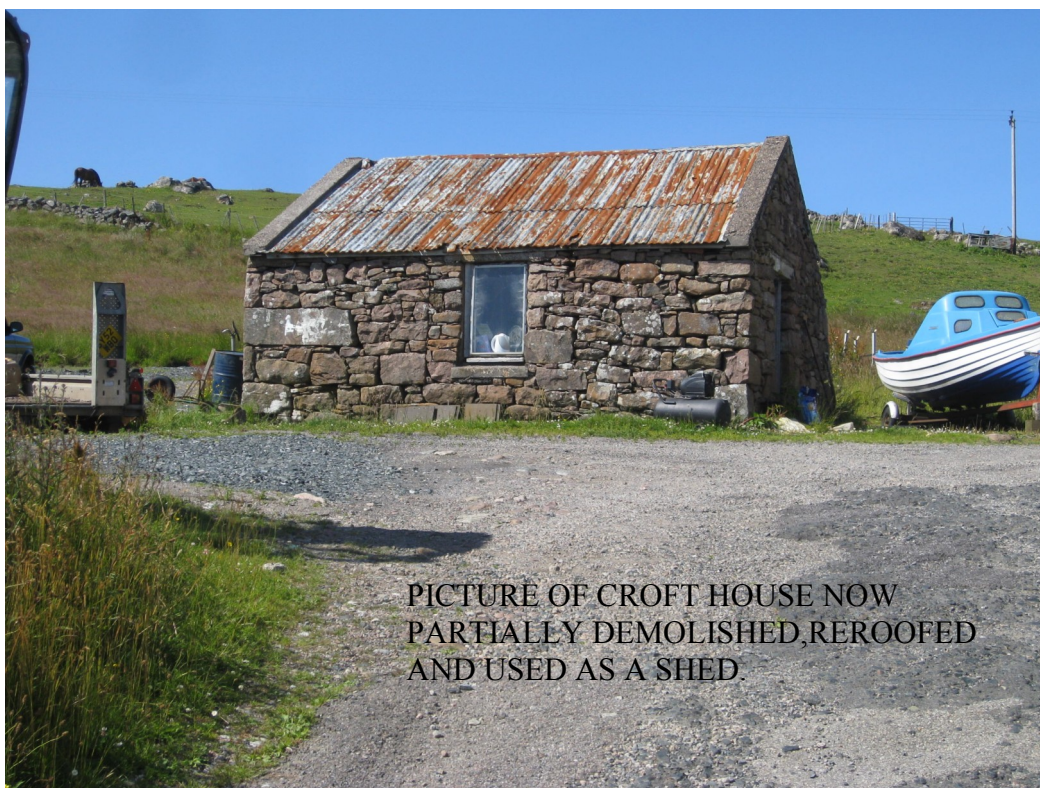
PICTURE OF CROFT HOUSE NOW PARTIALLY DEMOLISHED, REROOFED AND USED AS A SHED.

Another house built in 1900 has been modernised and extended and is lived in on a permanent basis.