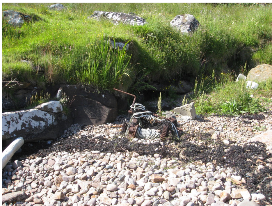
THE OLD WINCH