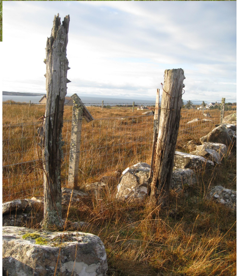
Picture two, the old gateposts on the head dyke between crofts 39 and 40.