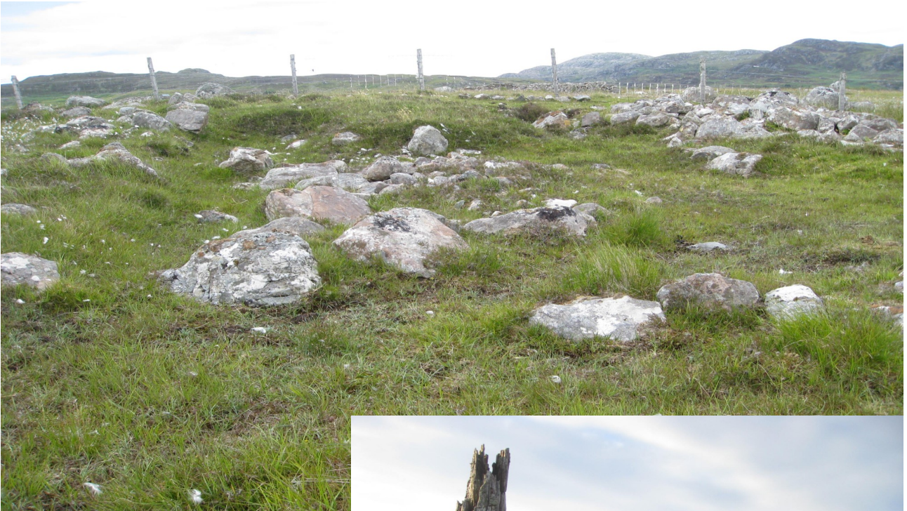
Picture one showing jumbled stones disturbed by peat cuts.

To the S of the croft runs a passage which has been encroached upon by the new build garden. To the N of the croft runs the township head dyke, and old gateposts show there was once an entrance onto croft 40.(picture 2)