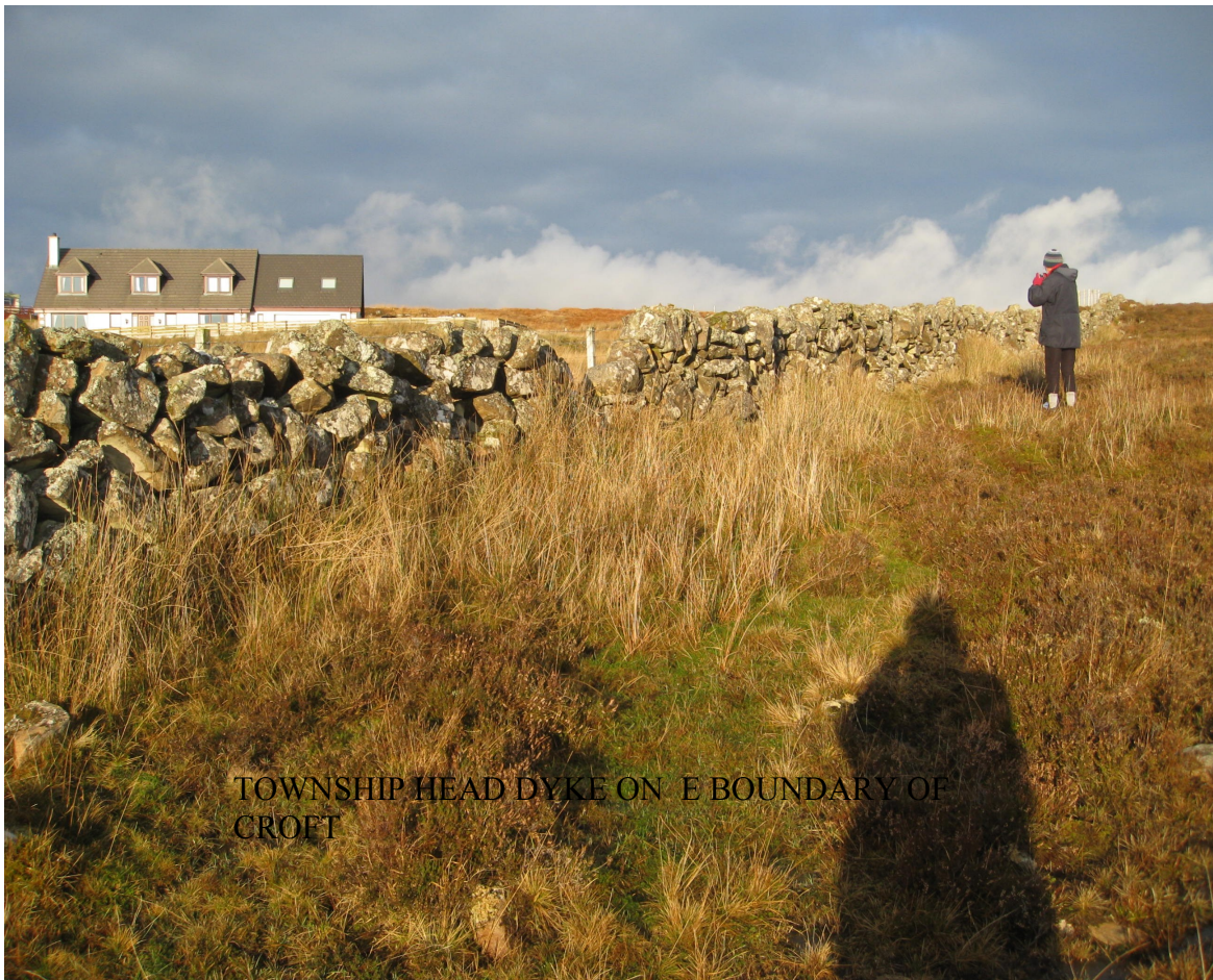
TOWNSHIP HEAD DYKE ON E BOUNDARY OF CROFT

The N and E boundaries of the croft are marked by the township head dyke, which is most intact on the E side (see picture)