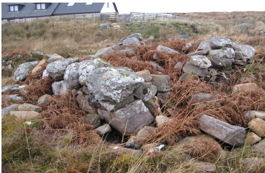
SMALL RUIN ON E SIDE OF CROFT

At the E side of the croft is a small ruinous building 4x5m and 1m high. This is not marked on any OS map.