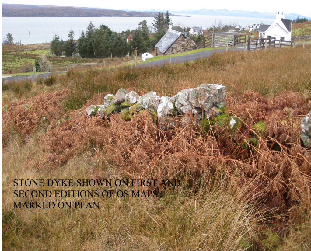
STONE DYKE SHOWN ON FIRST AND SECOND EDITIONS OF OS MAPS MARKED ON PLAN

Within the croft there is a stone dyke that is shown on both editions of the OS (see picture)