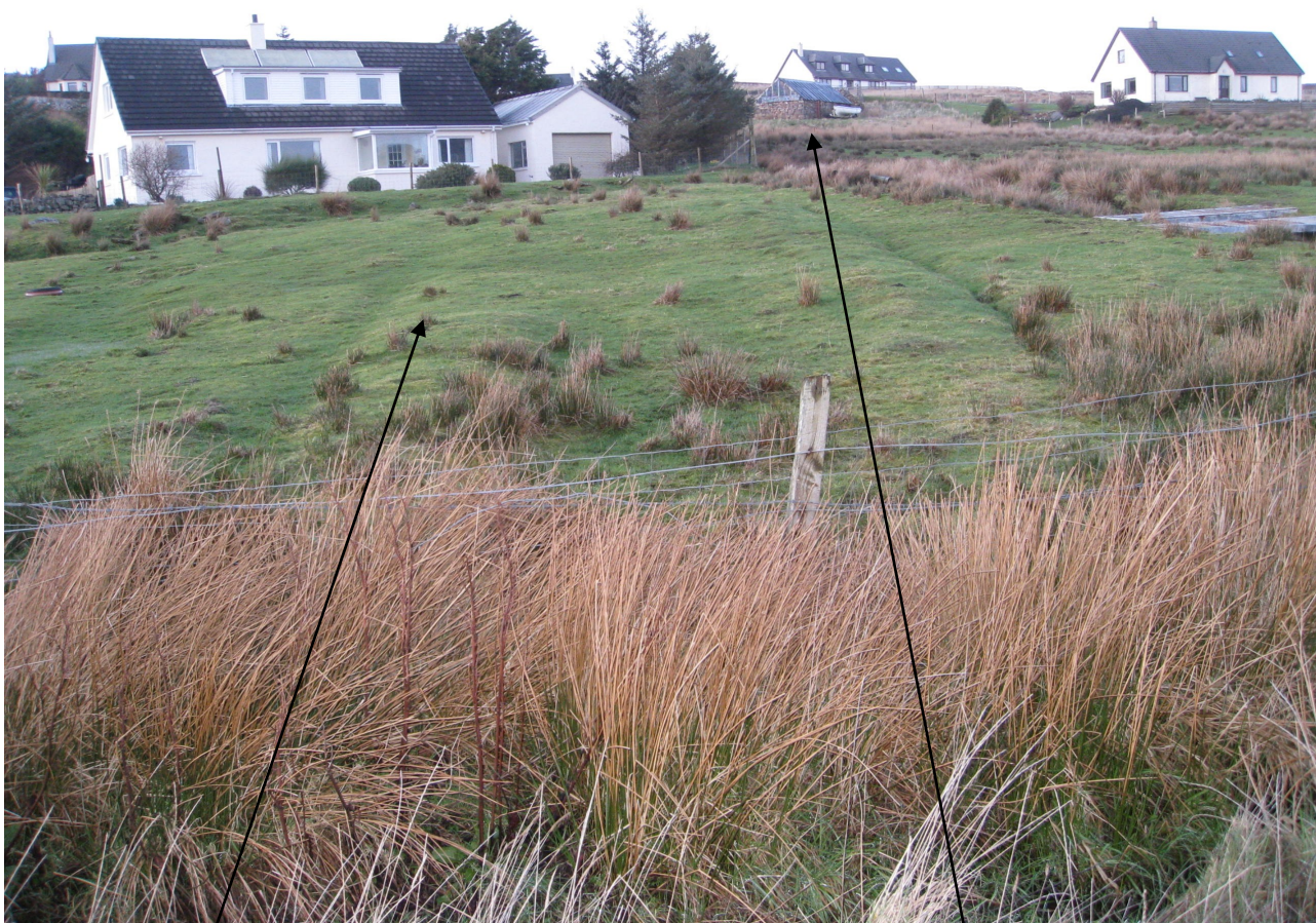
Evidence of lazy beds on croft 42. In the distance can be seen the 19th century building now used as a shed.

The W and S boundaries of the croft run parallel with access passages of the township. The W passage is now one of the roads through the township, and the S one a track providing access to other houses.