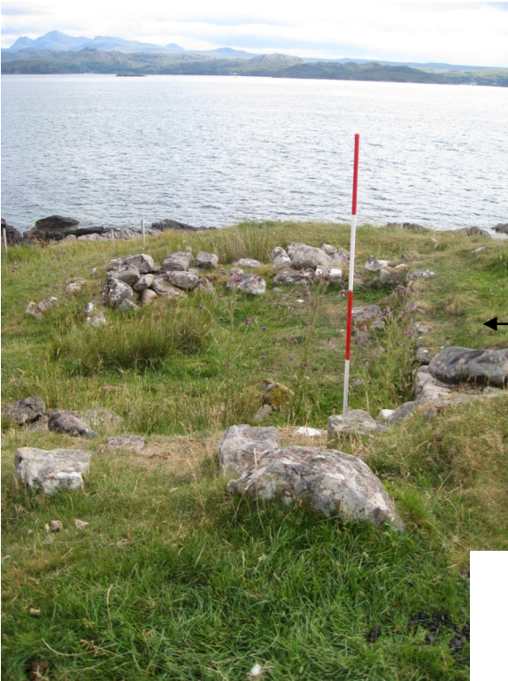
RUINS BY THE SHORE