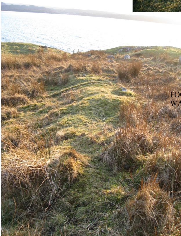
FOOTINGS OF TURF AND STONE WALLS

Scattered over the croft are large piles of big boulders as marked on plan. These were exposed when the new sewage pipeline was installed and the present crofter piled them up to create shelter for sheep from the strong prevailing winds that sweep up the sealoch.