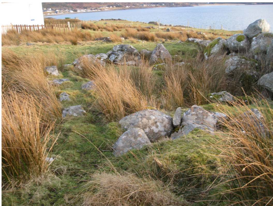
THE FOOTINGS THAT REMAIN