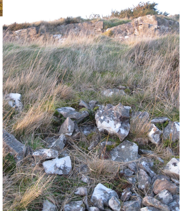
OLD QUARRY WHERE LINTEL STONES WERE CUT

The first and second OS maps show two roofed and one unroofed building.