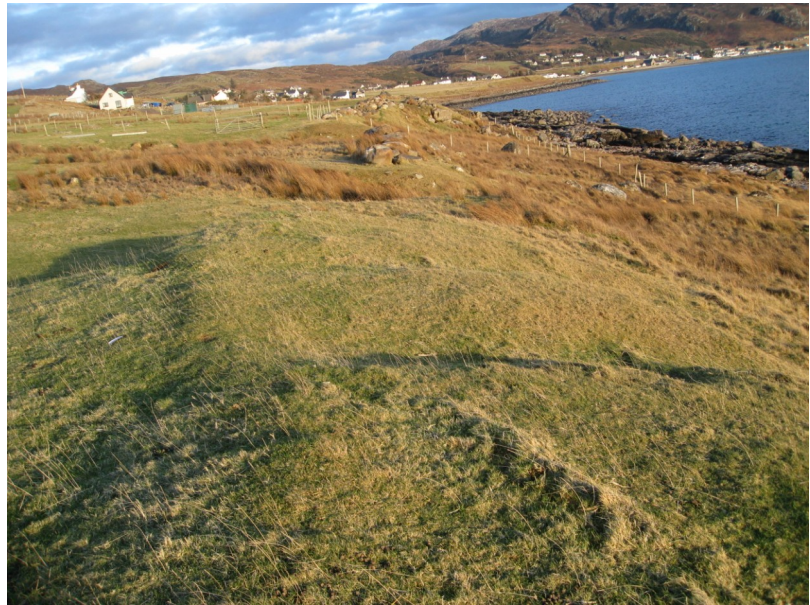
TRACES OF LAZY BEDS

On the croft are the remains of boulder dykes and the footings of older turf and stone walls (see plan)