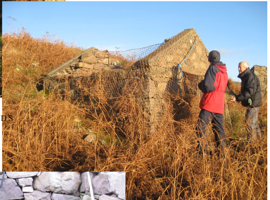
THE HENHOUSE SHOWING W AND S WALLS