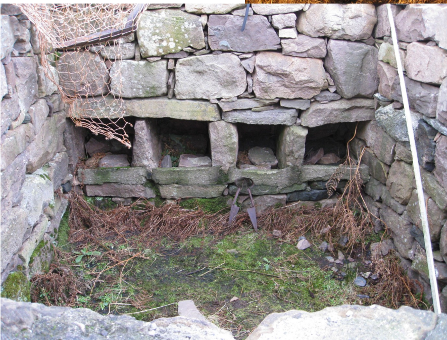
THE NESTING BOXES