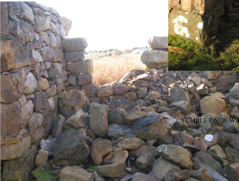
TUMBLE ON W WALL OF SHED