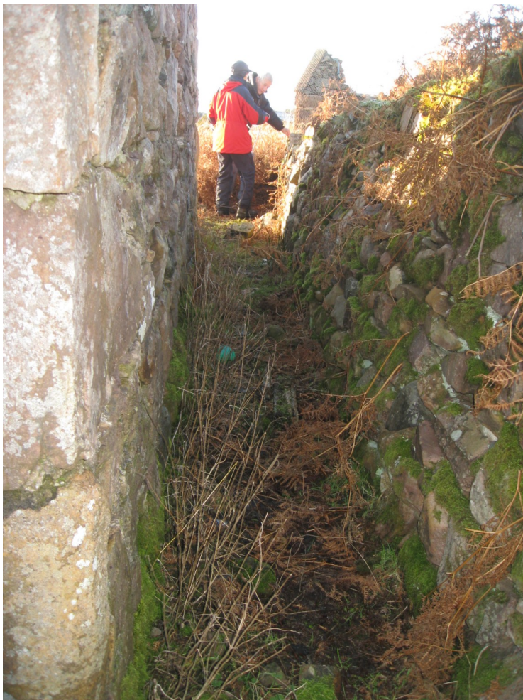
THE RETAINING WALL BEHIND THE SHED WITH THE HENHOUSE IN THE BACKGROUND.

These two ruins have a southerly aspect and are situated on a level area of ground immediately S of a substantial stone wall that is revetted into the hillside, to stop the slope from collapsing onto the buildings and forming a terrace behind them.