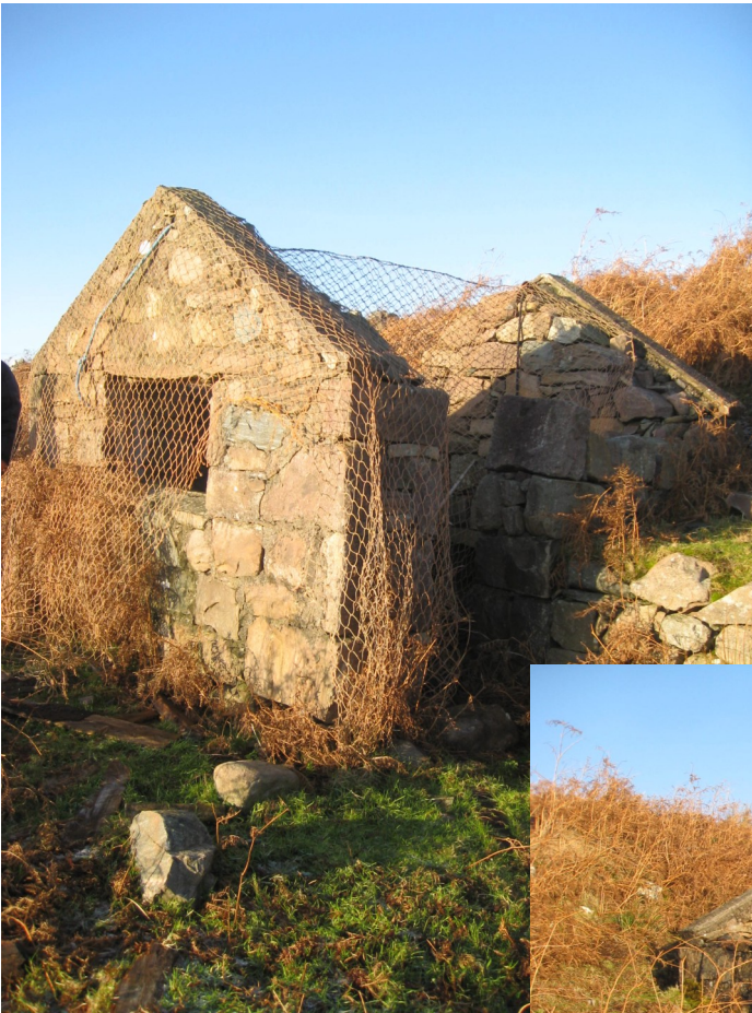
THE HENHOUSE SHOWING S AND E WALLS