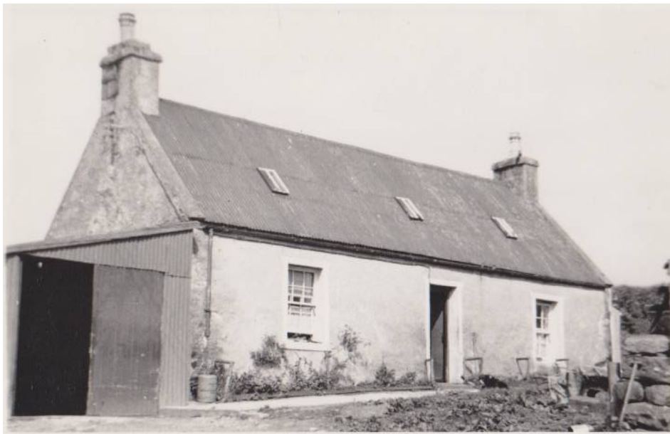
PICTURE OF HOUSE TAKEN IN 1927

On the first OS there are two buildings marked. All that remains of the building at 78530 77670 is a boulder wall revetted into a slope. The other building (78510 77660) is a house that has been extended and modernised and is still lived in on a permanent basis. This has recently had repairs done to the harling, so with an earlier picture provides a history of the building.