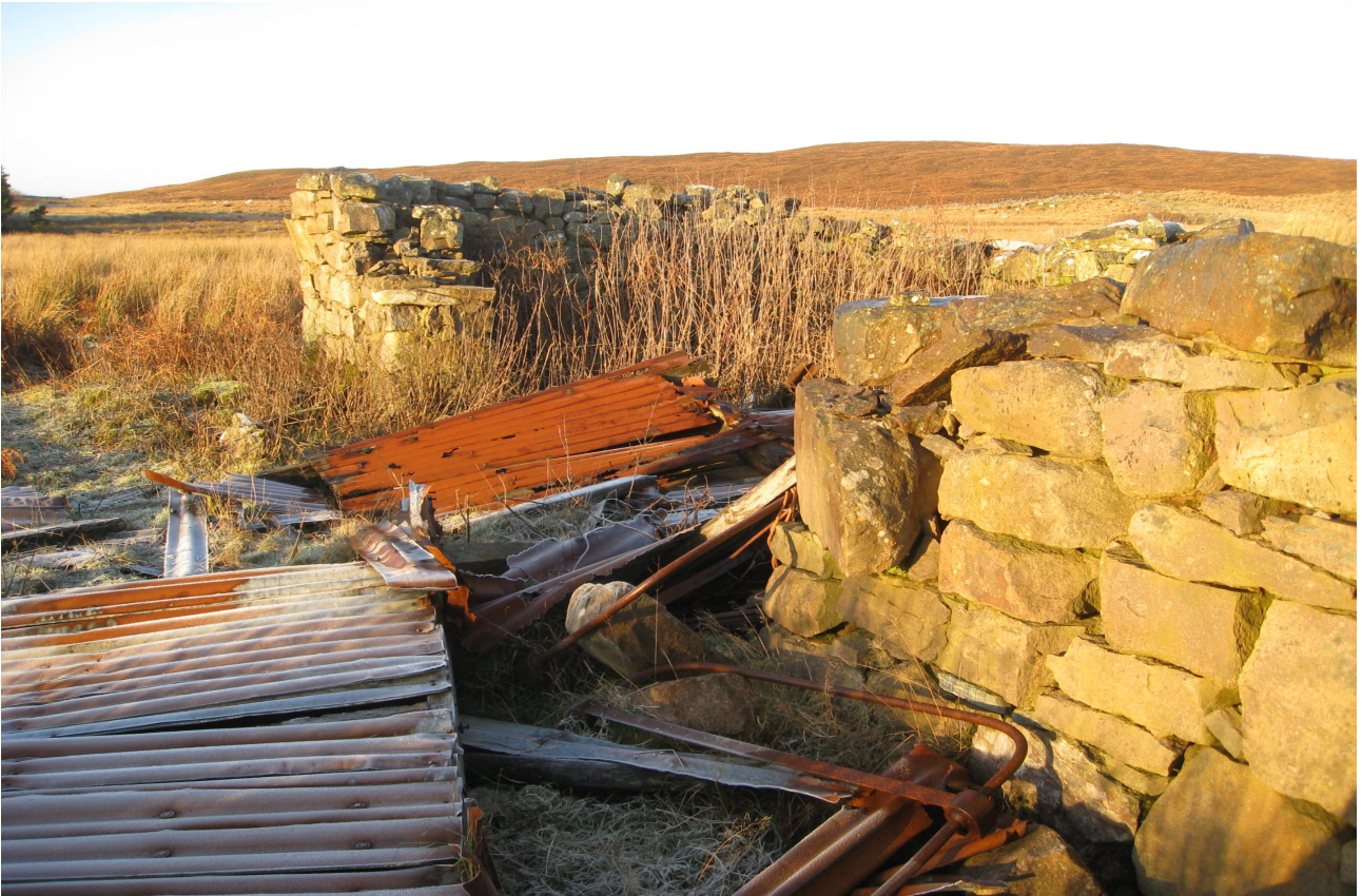
RUIN OF BYRE ON CROFT 52 SHOWING WIDE ENTRANCE AND WELL CONSTRUCTED WALLS

RUIN ON CROFT 52 LONEMORE CROFTING TOWNSHIP NG 78510 77718 GPS