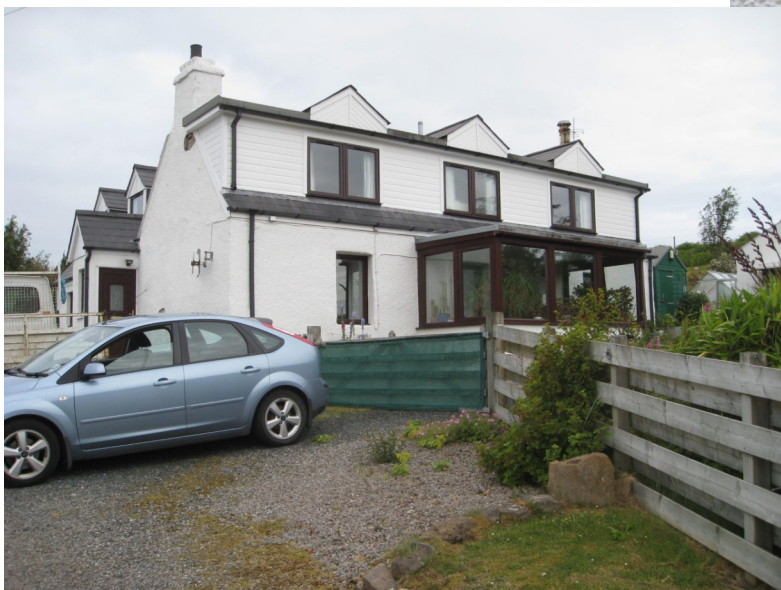
HOUSE IN 2009