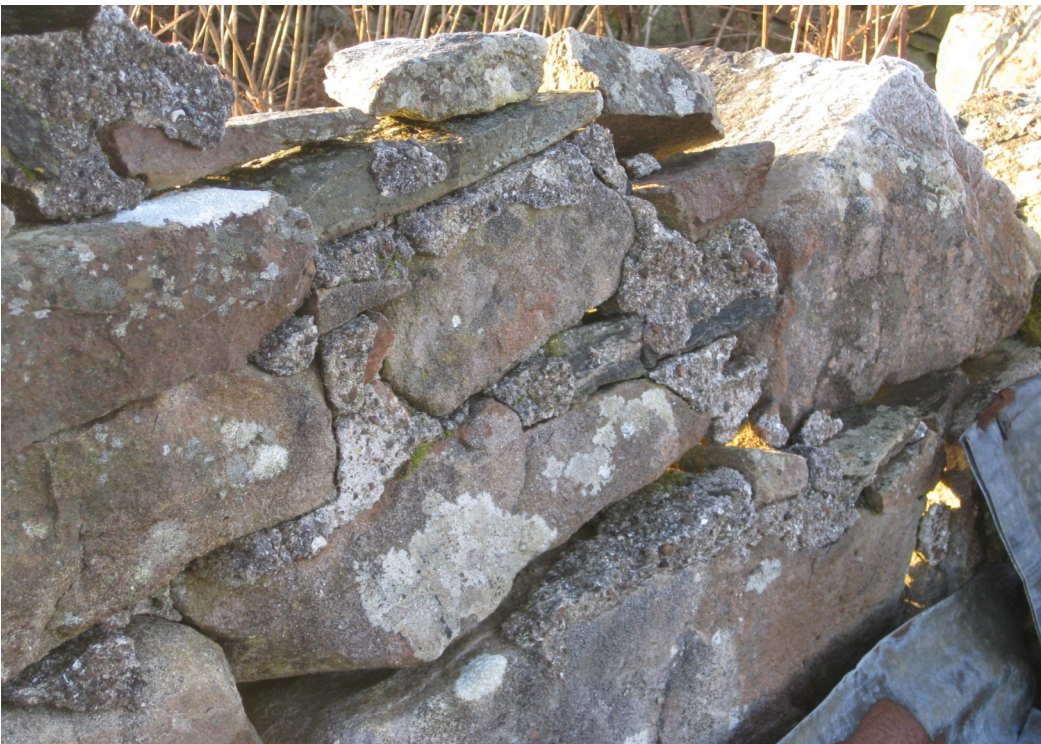
DETAIL OF WALLS SHOWING THE DRESSED STONE, SNECKING AND SOME ROUGH HARLING