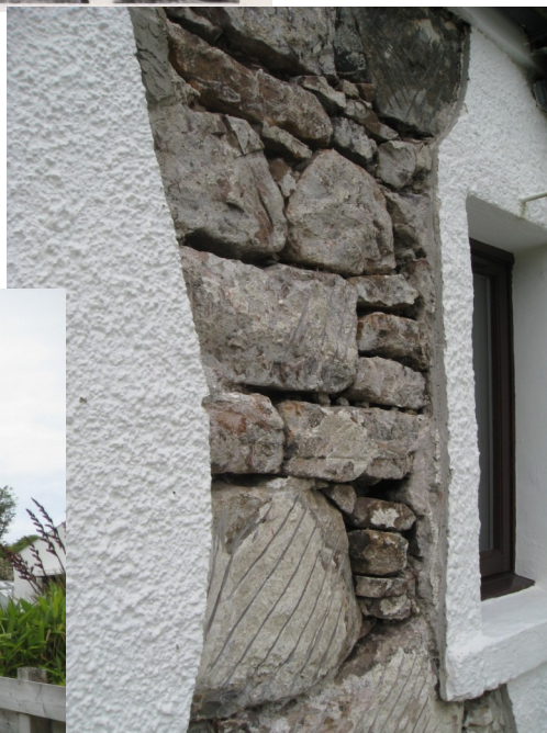
REPAIRS TO THE HARLING