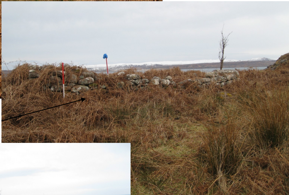
RUIN OF BARN SHOWING S WALL