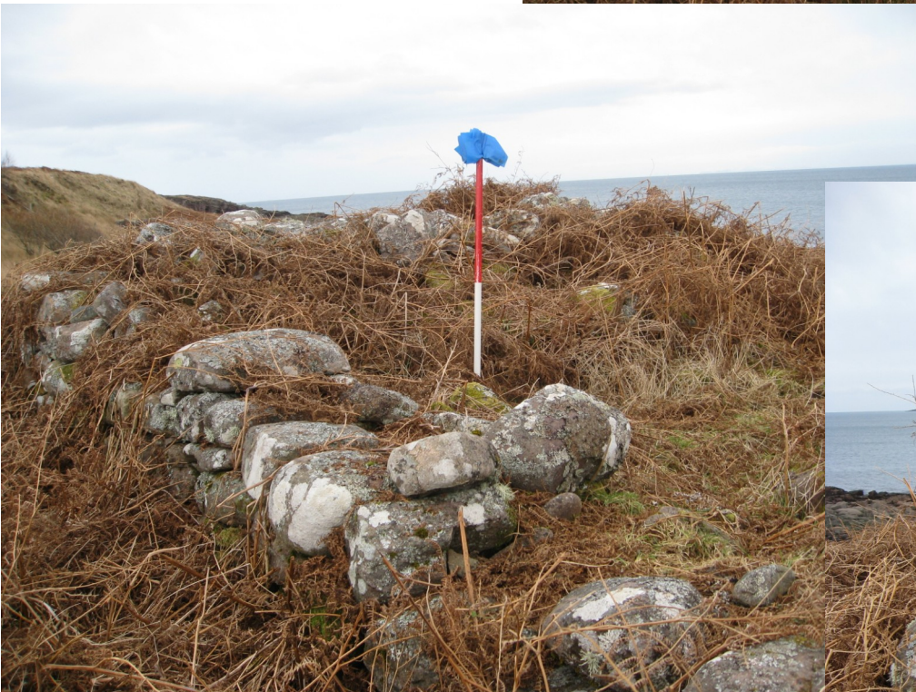
SHOWING THE TUMBLE IN CENTER OF BARN AND DETAIL OF BOULDERS IN WALLS