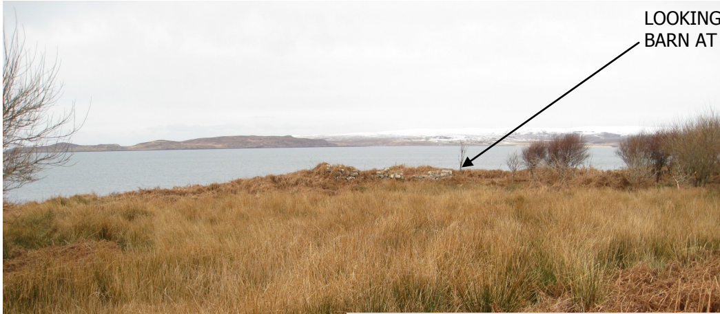
LOOKING N SHOWING POSITION OF BARN AT EDGE OF CROFT