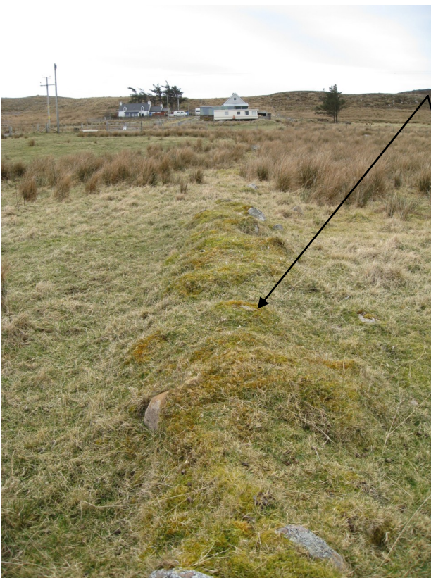
Footings of stone dykes croft 5