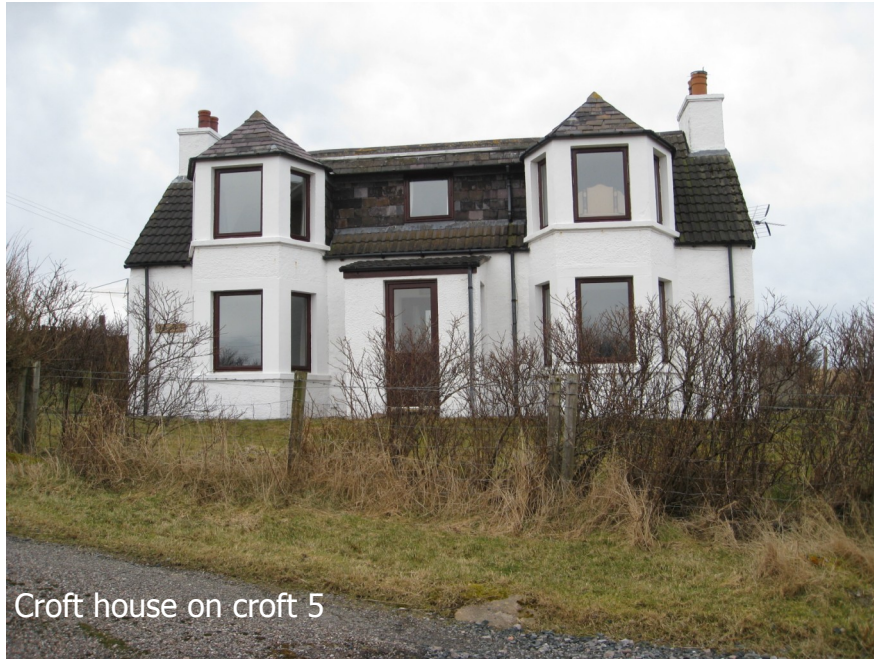
Croft house on croft 5

The ground on this croft slopes gently from S to N, and although once used for arable cultivation as shown by stone clearance piles, footings of parallel stone dykes, and a drainage ditch, it is now used for occasional livestock grazing. The estate map of 1845 gives an acreage of 3.75. An original croft house shown on the 1st OS is still used as a holiday house, and there are the ruins of a barn and enclosure ( see separate description)