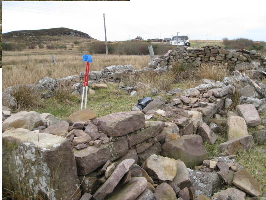
LOOKING SW AT RUIN OF BARN/BYRE