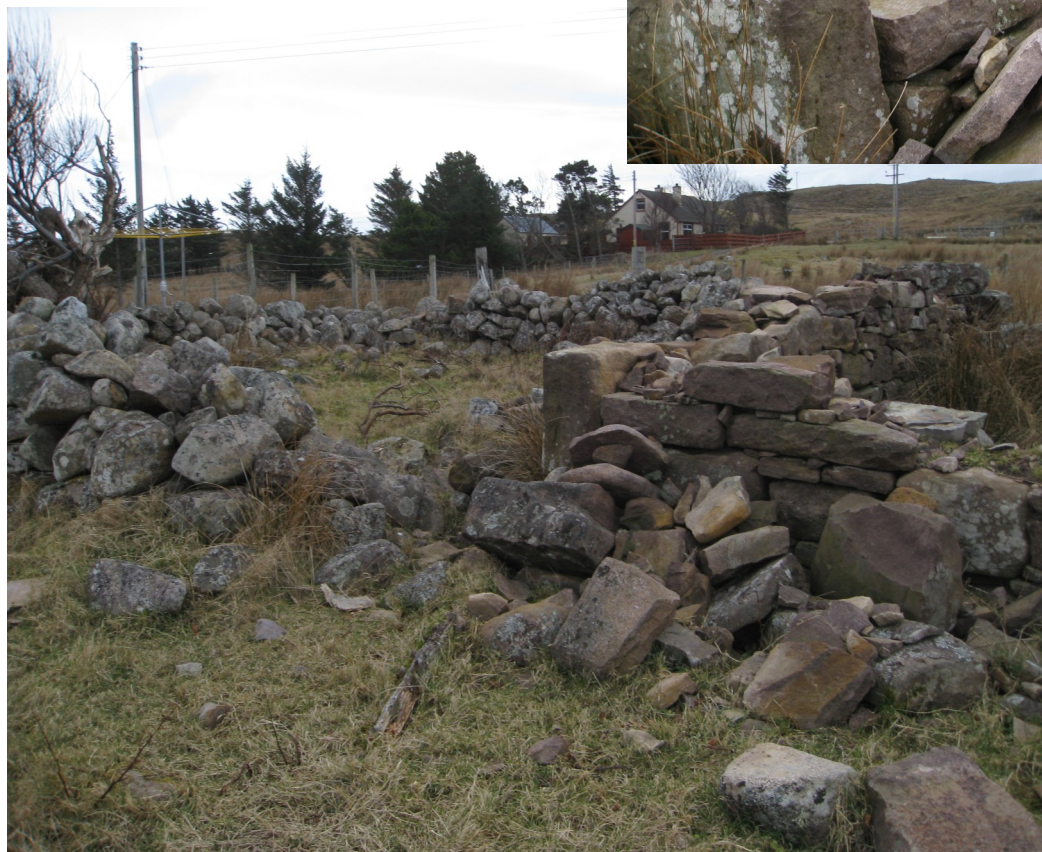
LOOKING SE AT E END OF BARN/BYRE AND ENCLOSURE