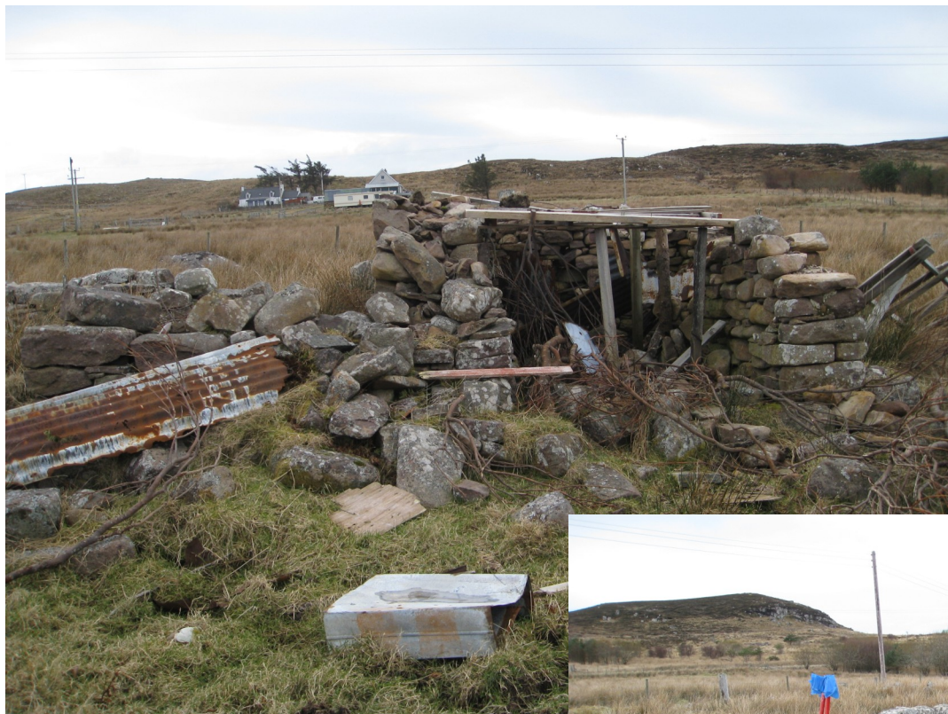
LOOKING SOUTH SHOWING RUIN OF SHED AND W END OF BARN BYRE.