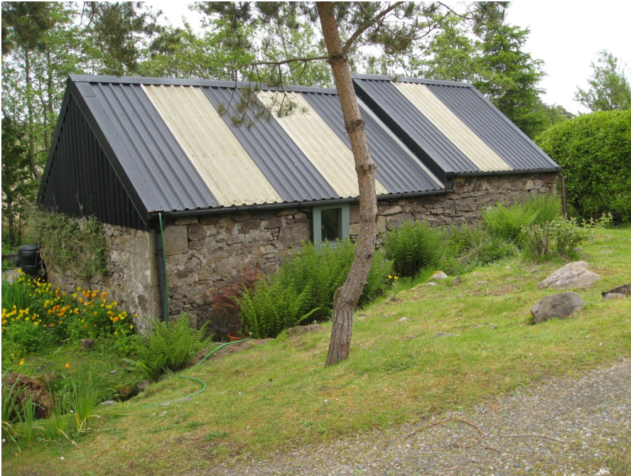
The old barn