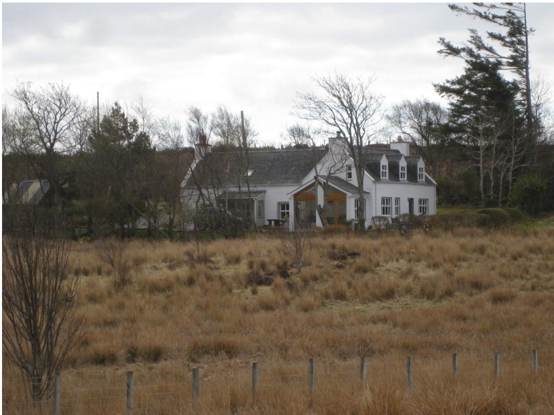
Looking S over Croft 11 towards the main house with extension. The Barn can be seen on the left through the trees

The estate iron fence continues along the SW boundary of the croft but the main fence is post and wire now.