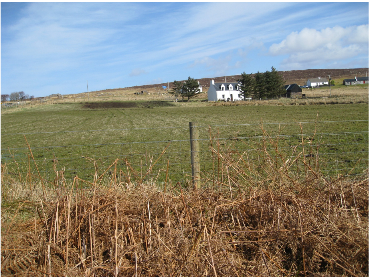
Looking N over Croft 14 showing improved ground, the house and byre.

On the W and N boundaries of the croft are some footings of stone dykes but the boundaries are now marked with post and wire fencing.