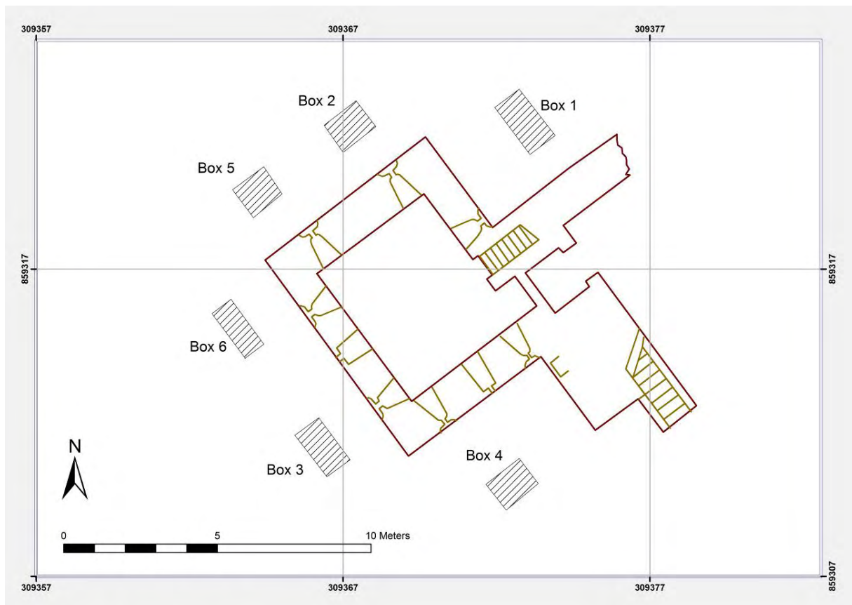
Figure 2 Plan of observed trenches (derived from a plan by Elliott & Co. GB National Grid)