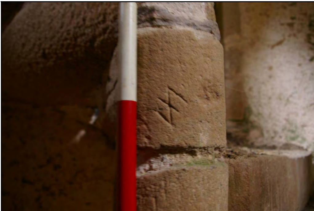
Plate 1 Masons mark on staircase

However only limited information was found in these sources. The results are summarised above.