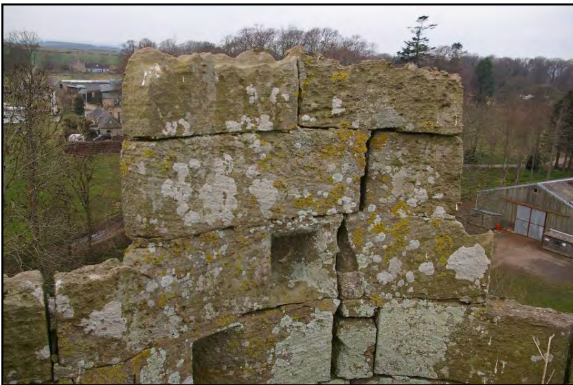
Plate 5 Bartizan: mortar bonding failure

The erection of scaffold and shoring from each box did not appear to interfere with any archaeology. However, the subsequent appearance of a stone wall in the extension to Box 3 demonstrates the existence of buried archaeological features which should be investigated and recorded when consolidation work to the tower takes place. There are however no recommendations for further archaeological fieldwork at this stage.