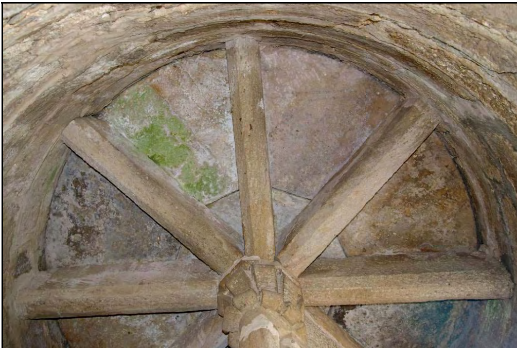
Plate 2 Decorated top to stair

Many decorative features were also noted, including the decorative top to the staircase (Plate 2). However in the absence of scaffolding or other means of access it was impossible to record features high up on the outside of the building.