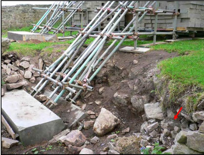
Plate 4 Wall discovered after watching brief following Box 3 enlargement