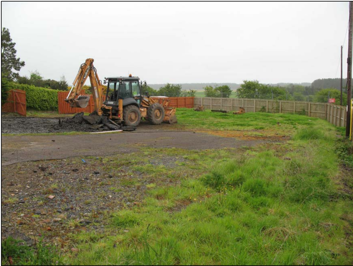
Figure 3a: View of the Site prior to ground reduction