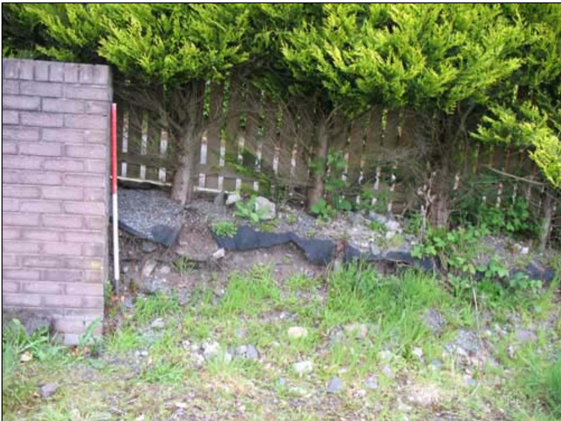
Figure 5b: Change in ground level between Development Area and adjacent road to East