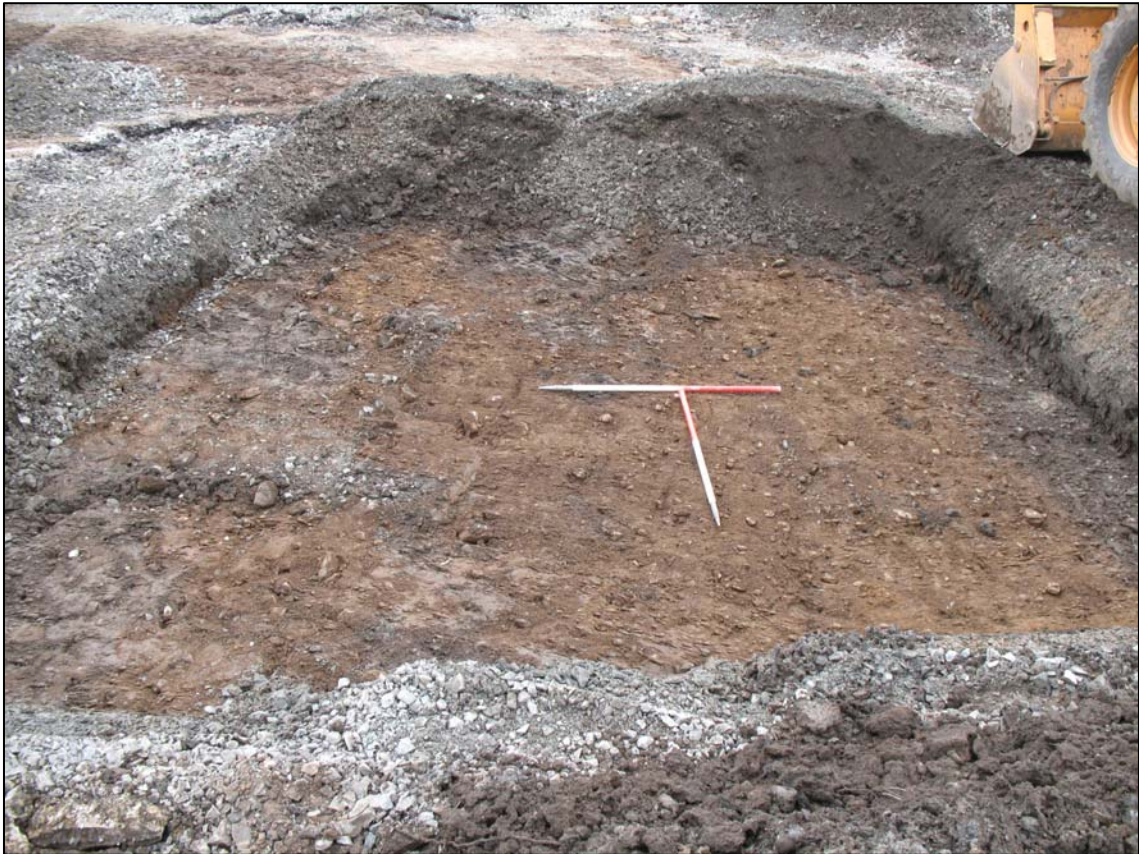
Figure 5a: Trench 3, Showing Natural, Undisturbed Subsoil