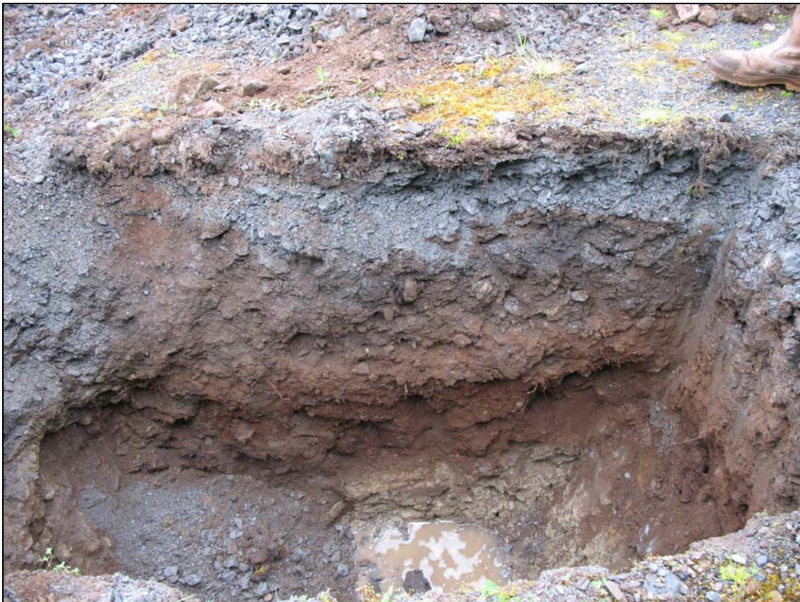
Figure 3b: Test Pit 1 – Soil Profile, E-Facing Section