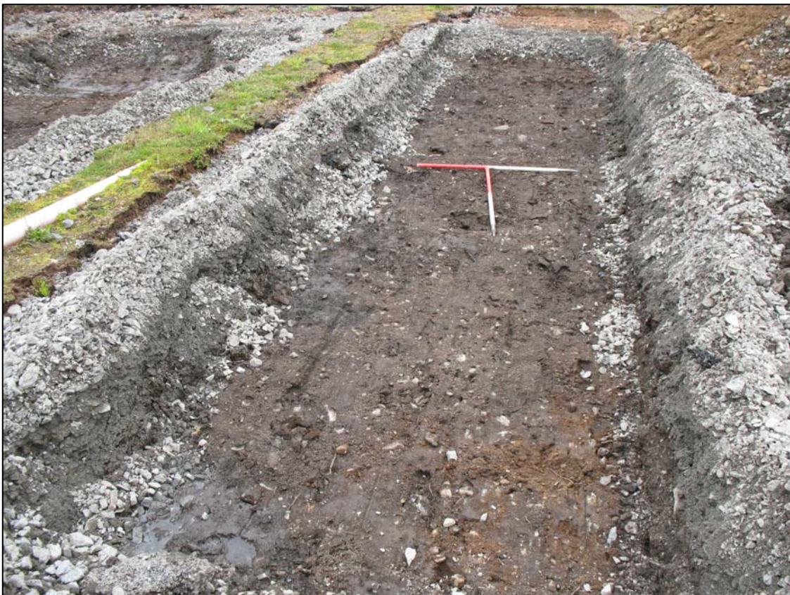
Figure 4b: Trench 1 – Subsoil exposed