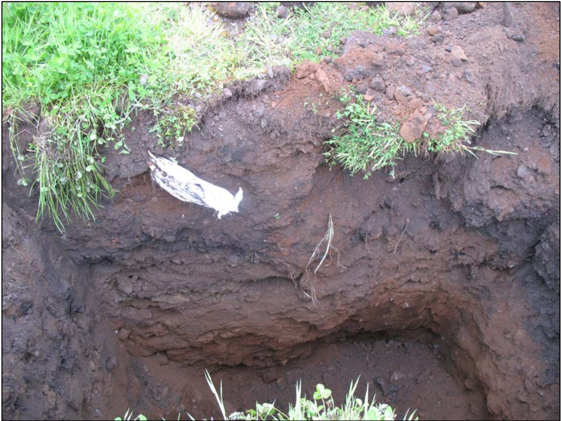
Figure 4a: Test Pit 3 - E-Facing Section