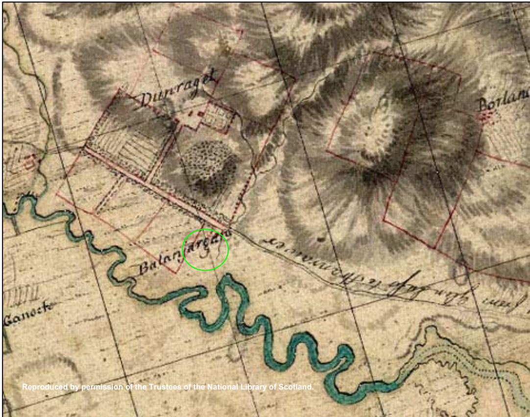
Figure 1a: Roy's Military Map (1747-55) Showing Dunragit House and the Military Road