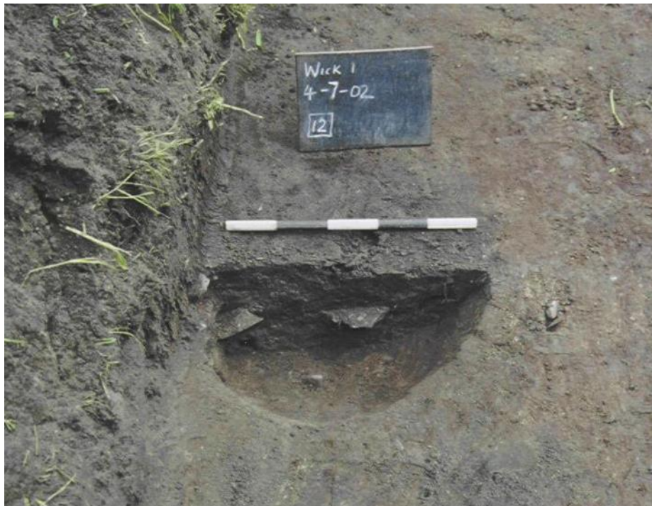
Top : View of pit 13 facing south showing fill 12 – scale 0.5m Bottom : View of building facing south – scale 2m