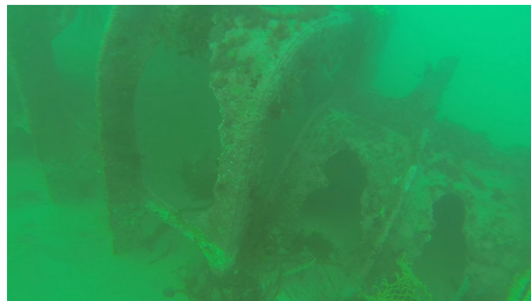
Contact 2: Propshaft tunnel