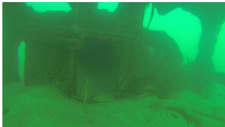
Contact 2: Door