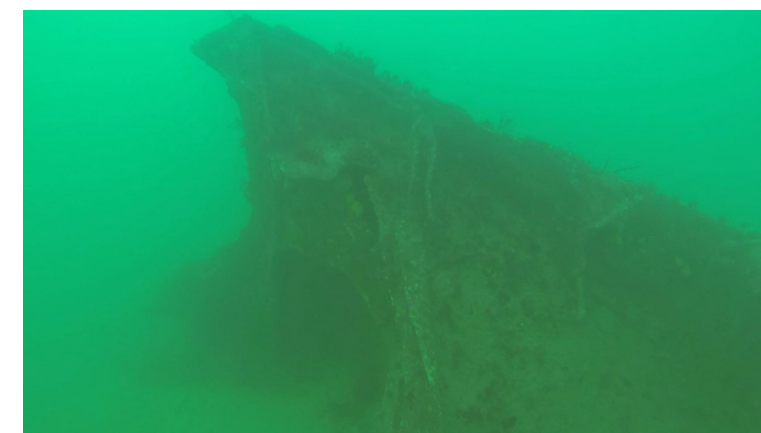
Contact 3: Stern section fragments

Selected images are from approximate areas of the site. These are labelled by an appropriate letter