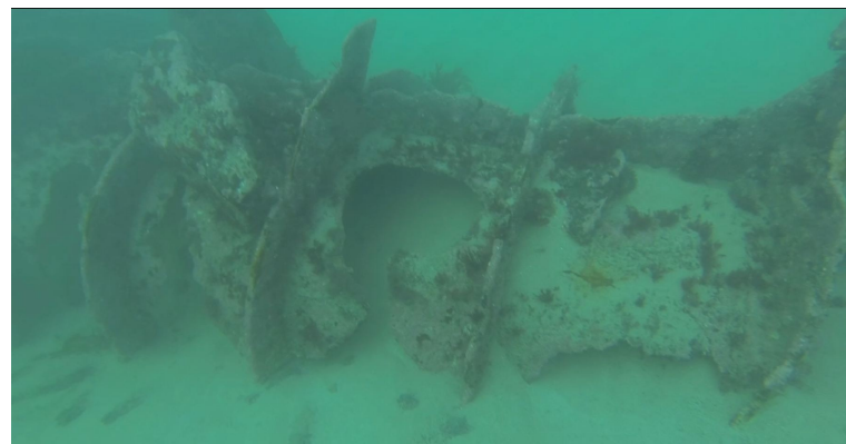
Contact 2: Part buried section