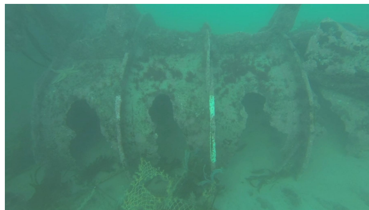
Contact 2: Propshaft tunnel reduction