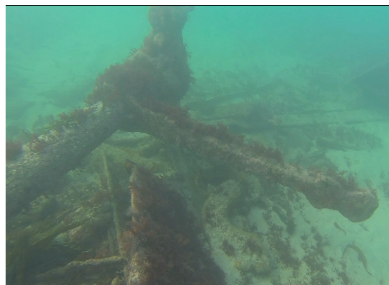
A: Steering quadrant