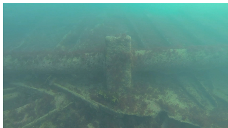
B: Propellor shaft