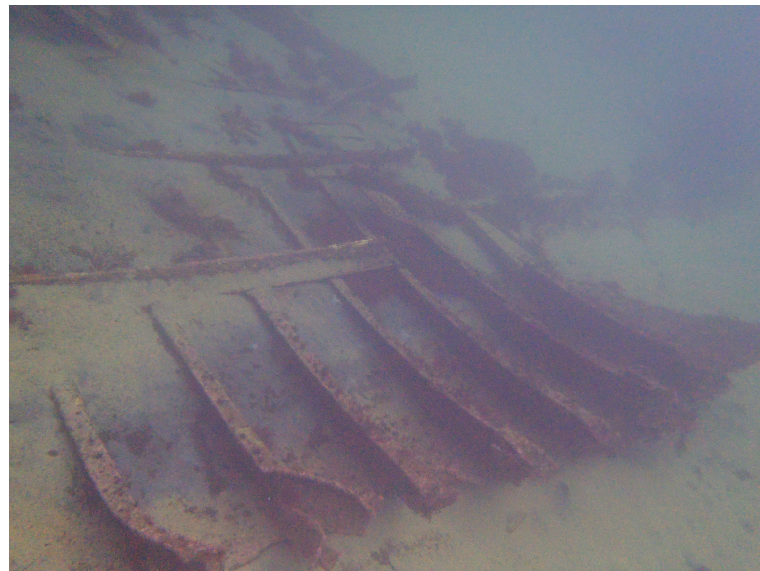
A: Hull plates and encroaching sand