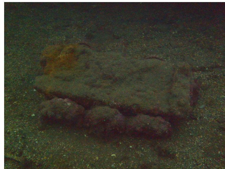
D: Sea chest

Selected images are from approximate areas of the site. These are labelled by an appropriate letter