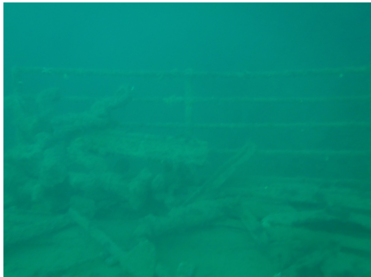
A: Stern railing