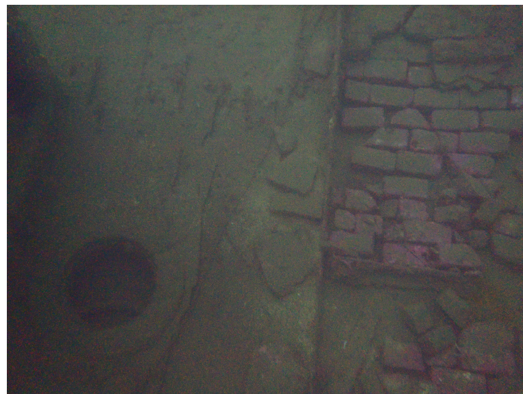
C: Sea Galley floor