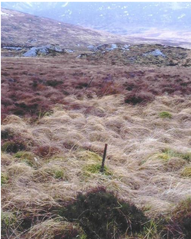
Line of fence posts facing north

It should be noted that the cairn on the summit of Meall Damh is a marker only. Also occasionally visible was the remains of the fence-line marked on the OS map of 1903 in the form of cast-iron fence posts.