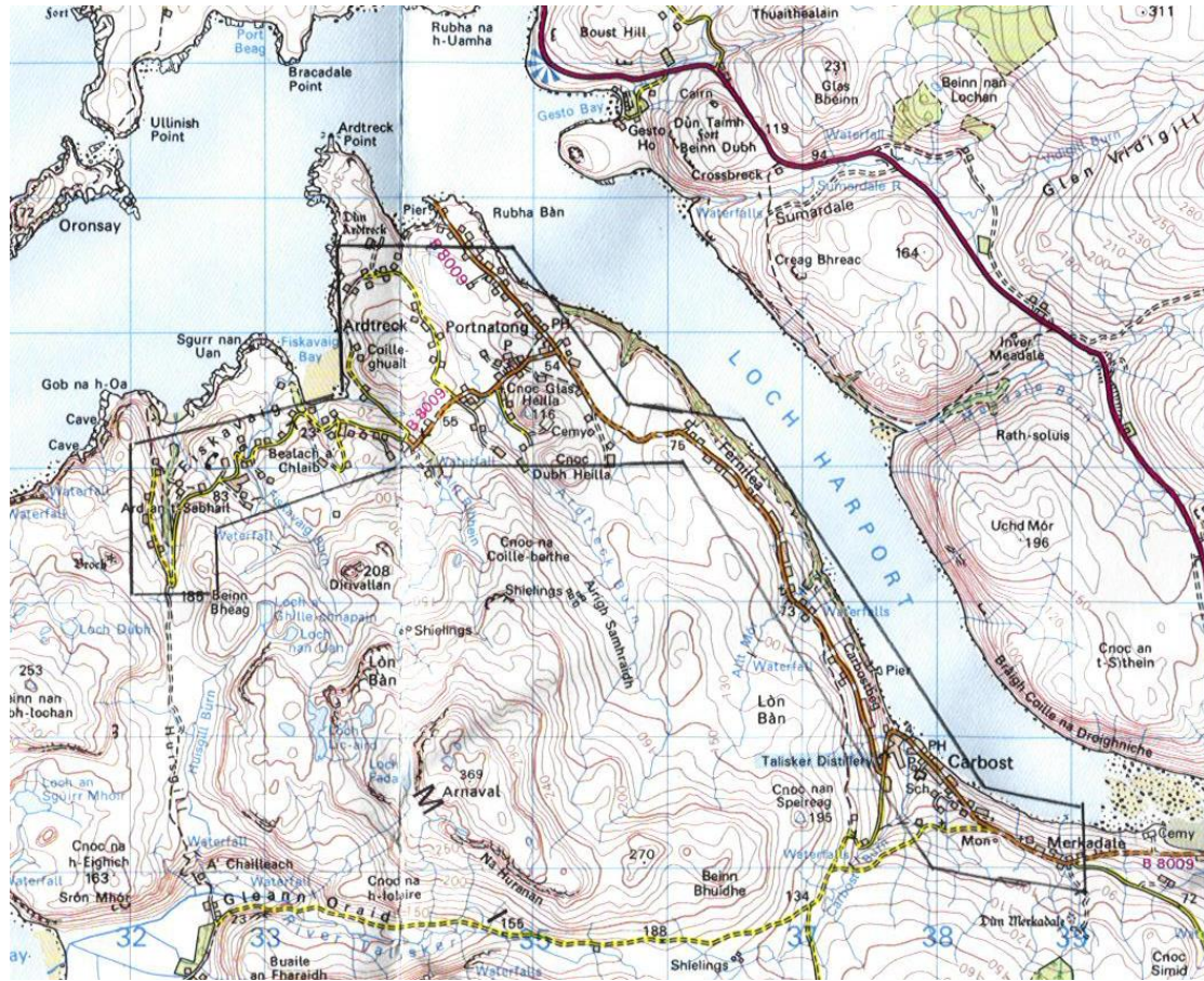
Figure 1: General Survey Location 1: 50,000