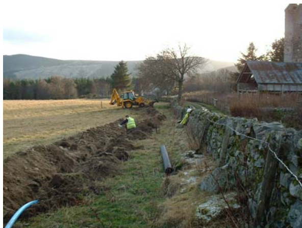
Photo1: View of trench facing S.

Excavation of a trench 0.5m wide for a length of c130m in a grass field to the east of the tower revealed no archaeological deposits or features only natural yellow-brown sandy-clay below an average topsoil depth of 120mm.