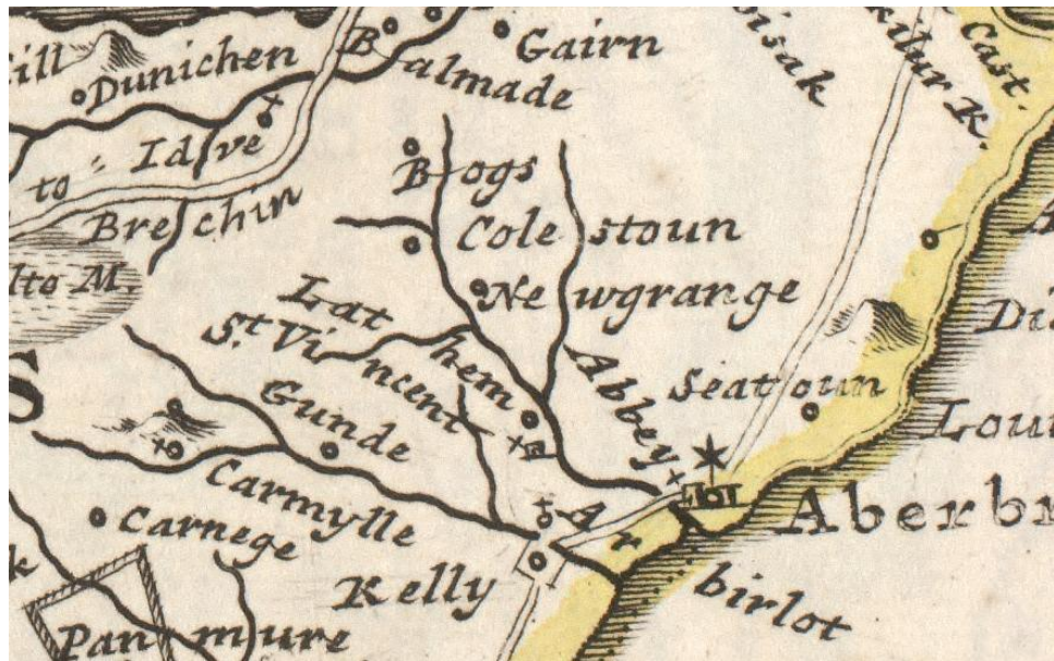
1794 John Ainslie : Map of the County of Forfar or Shire of Angus, South East Section. Letham Grange shown as New Grange.