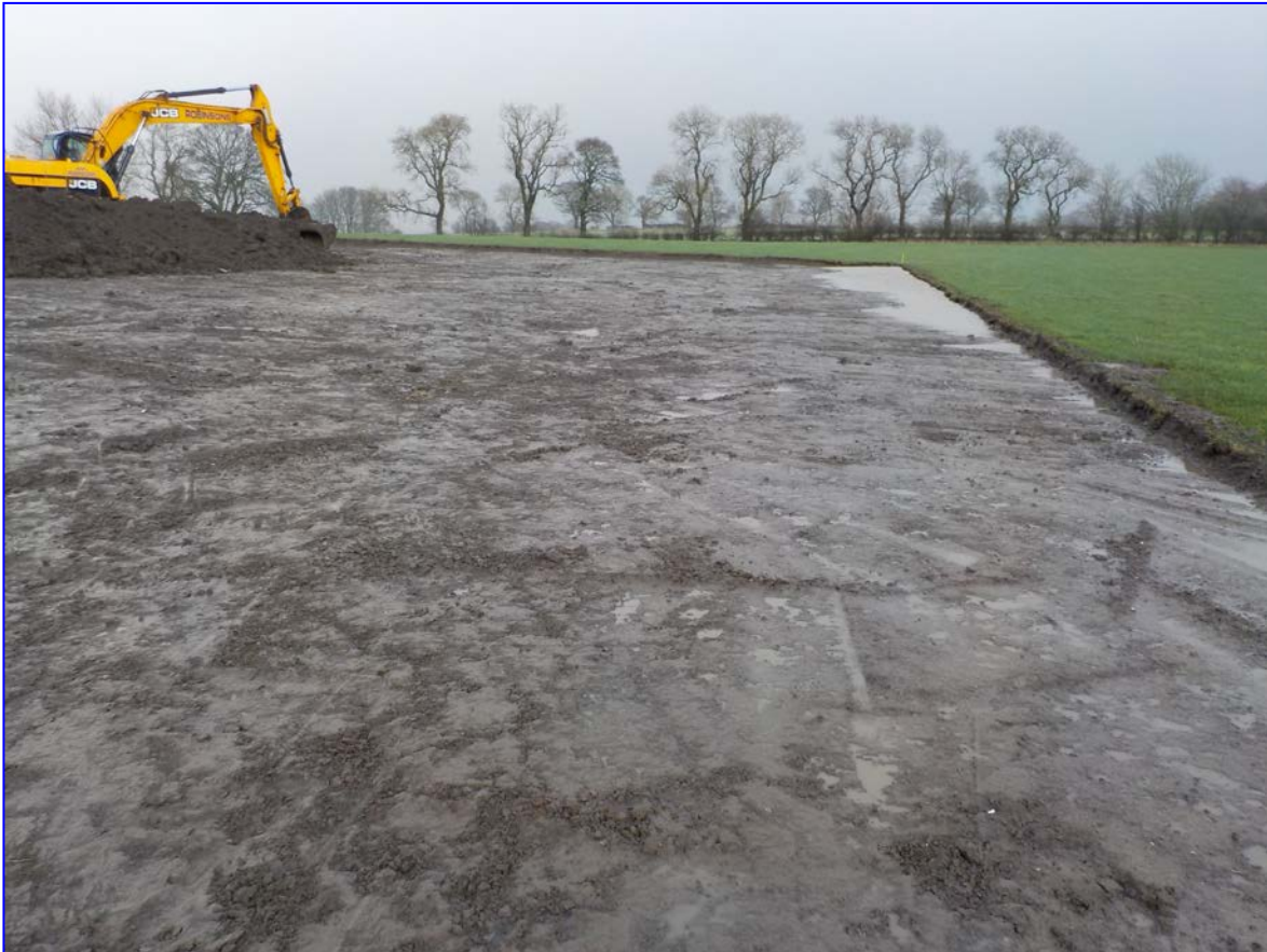
Plate 1 General view of stripped area

4.3 An area of 40m x 35m was excavated, revealing a mid brown heavy clay loam topsoil (000), with occasional white ceramic fragments. This was over a natural of mid grey boulder clay (001). No archaeological finds or features were uncovered during the watching brief.