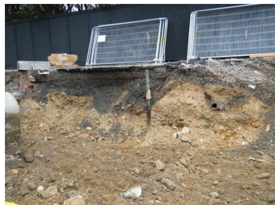
Illus 5 East facing section at the south end of Trench 2 ground reduction

A second shorter trench (Trench 02) ran along the western perimeter close to the Leonard's Field development. The excavation of this trench required the ground level to be reduced by approximately 1.5m. This exposed the east facing section of the development perimeter close to the south-west end, revealing the geological subsoil immediately underlying the tarmac surface of the existing car park at approximately 8m OD ( Illus 5 ). The ground reduction of this area also revealed that the sand and gravels had been cut by a number of modern service pipes and manholes associated with the demolished hospital.