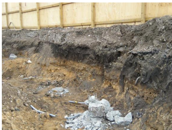
Illus 6 Detail of the buried soil recorded in the south facing section at the north-east corner of the development area.

A third (foundation) trench (Trench 03) close to the northern perimeter of the development area was also monitored. The trench was approximately 1m wide and excavated to a maximum depth of 1.5m. Inspection of the sections exposed by the excavation of this foundation trench revealed that close to the north-east corner of the development area evidence of a buried soil overlying the sand and gravel geological subsoil (Illus 5) was present. The soil comprised dark brown sand with occasional small stone inclusions. This material had a maximum depth of 0.5m (approximately 5.5m OD) and was sterile of archaeological features or artefacts. The buried soil was overlain by 0.5m of made ground, although the interface between the two layers was very diffuse. This would indicate that the buried soil had probably been horizontally truncated removing any surviving old ground surface. The south facing section along the northern perimeter showed that the buried soil became less prevalent towards the west side of the site with no evidence of this material identified at the western end of Trench 3.