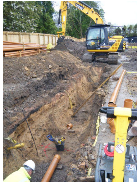
Illus 4 View of Trench 1 showing the west facing section 30m from the north end

The trench recorded between 0.1 and 0.4m of made ground, comprised of dark brown sand with frequent construction debris inclusions, overlying the mid yellow sand and gravel geological subsoil ( Illus 4 ) at approximately 5.5m OD