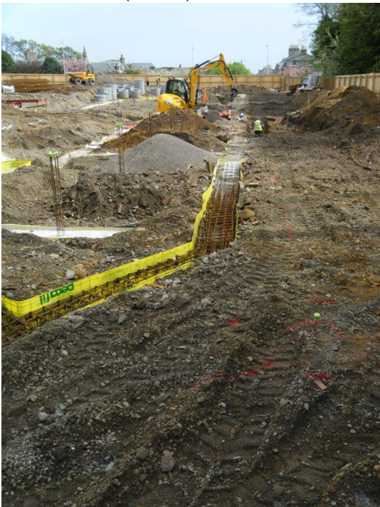
Illus 3 General site view showing the excavation of Trench 1, facing north.

The service pipe trenches were located along the perimeter of the site with two long lengths along the east and west boundaries. The trench along the eastern boundary (Trench 1) was positioned close to the top of the bank that led down to the Kinnes Burn ( Illus 3 ).