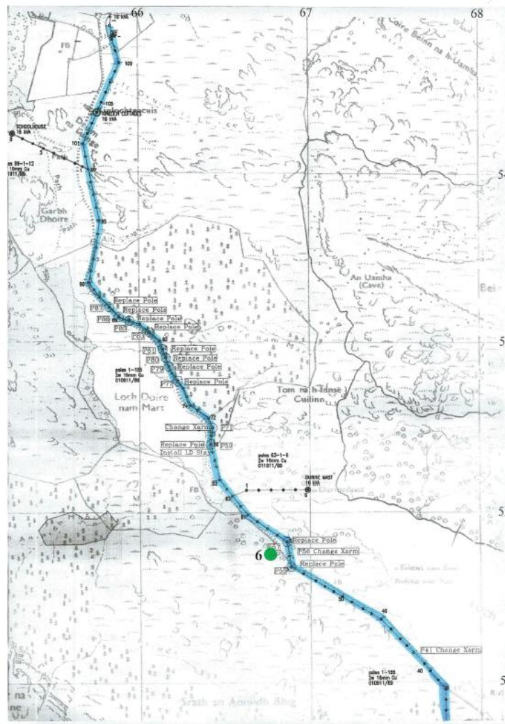
Map showing sites on the northern half of the route