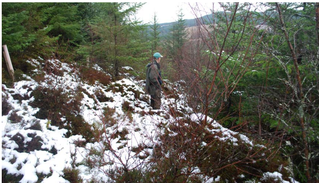
General view to NNE over the south part of the pipe route in forestry section.

The southern third of the pipeline route runs along the west bank of the Allt Doire nan Sobhrachan (transliterated as ‘burn of the clumps of primroses’). The intake weir is located adjacent to a forestry borrow pit / parking area and then crosses the forestry track into the edge of Forestry Commission conifer plantation. The route then skirts along the edge of the conifer plantation on a lower hill slope, which drops steeply down to the burn. This land is uneven and under the snow it was apparent the ground cover was heather and bracken amongst tree stumps, occasional glacial erratics, a few outlying conifers at the very edge of the plantation and self seeded willow saplings and trees. The water run-off down this slope into the burn, which is in a ravine, has created boggy conditions in the level areas and there are several small water courses draining off the hillside into the burn. No archaeological sites were observed in this area. Although the visibility was extremely poor due to snow cover over bracken and tree stumps on topographic grounds alone this hill slope above the ravine in which the burn runs in this area is not an ideal location for settlement or other activities.