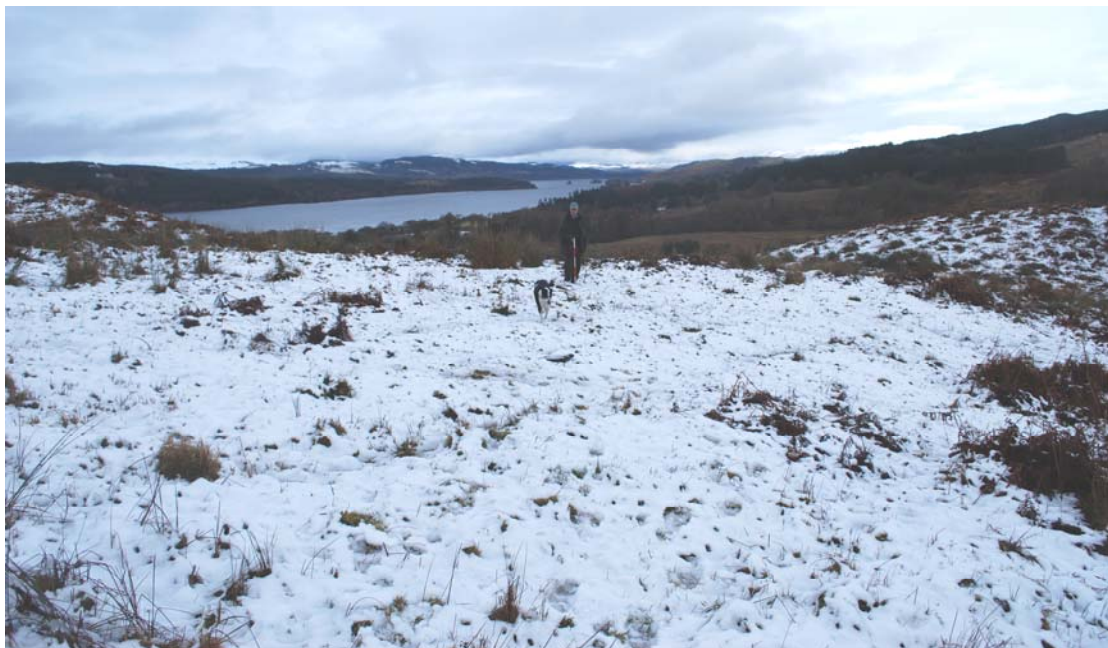
Survey conditions, general view N over Site 2, building and rig and furrow.

This report is the result of the walk over assessment and puts forward a method statement for dealing with the archaeological remains identified by the survey during the hydro-electricity development. The walk over survey was carried out on 20 January 2009 in overcast, cold and wet conditions with snow lying on the ground, particularly over the southern half of the route.