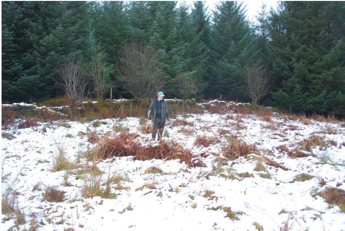
Site 2 possible rectangular building, view to the SW.

Immediately to the N of the boundary wall Site 1 is a pasture field which shows traces of rig and furrow agriculture. The rig runs in a NE-SW direction across the slope and the furrows are spaced c. 2m apart. There are several ‘humps and bumps’ in this area but the snow lying on the ground made prospection difficult. A possible rectangular structure defined by an intermittent line of boulders was located at the grid reference point given above and is pictured below. This structure was obscured by snow and bracken but appears to measure c. 6m x 4m and stand up to c. 0.40m high and is aligned NE-SW at 40°. There are several bedrock outcrops in this area that should be inspected for cup and ting markings and also a possible clearance cairn. The line of the pipe route will miss the possible building but a watching brief is required in this area and further prospection under better field conditions to determine if any other identifiable archaeological remains are present. The pipe route continues downslope from Site 2 and the rig and furrow is present on the hill slope.