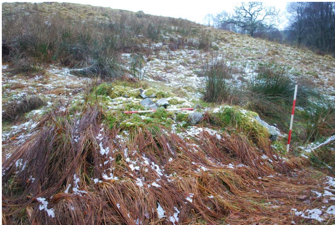
Site 6, possible corn drying kiln view to the south-east. The steading site is on the top of the knoll.

A possible corn drying kiln represented as a heap of stones measuring 3m diameter and standing to 0.60m high. Excavation would be required to determine if this is a corn drying kiln or a pile of clearance stones. This feature is located at the NW side at the base knoll on which the steading site (WoSAS PIN 51763) is located. This possible corn drying kiln is on the flat river bank and c. 10m from the river. The pipe route runs along the base of the knoll and avoids the steading but will run very close by this possible kiln. A watching brief is required in this area to ensure that the possible kiln is avoided. If it cannot be avoided it must be investigated by archaeological excavation and recorded. There are several boulders in the immediate vicinity at the base of the knoll on which the steading is located, which may represent tumbled stones that have rolled down the slope. However, only this sub-circular feature looks as if it might be a deliberate construction.