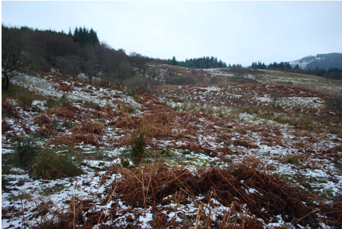
Site 3 collapsed stone dyke, view along its length to the west.

A collapsed dry stone dyke curving around the base of the hill in a roughly meandering E-W direction. This bracken covered dyke is a 1.5m wide spread of field stones measuring c. 0.25m x 0.20m on average and standing up to 0.50m high maximum. It may be built on an earth bank but in the areas examined appears more likely to have been a drystone wall. Rig and furrow (Site 2) is present to the south on the hill slope and rig and furrow (Site 4) is present on the level ground to the north. This suggests this dyke, which follows the base contour of the hill, is a field boundary. However, the land owner Mr Bowden Smith informed me that this dyke continues to the east and it may be a consumption dyke (i.e. clearance of field stones to improve cultivation as the primary reason rather than for construction of a land boundary). The dyke has already been cut through by a farm track and it is recommended the pipe route is laid through the existing cut and a watching brief is carried out.