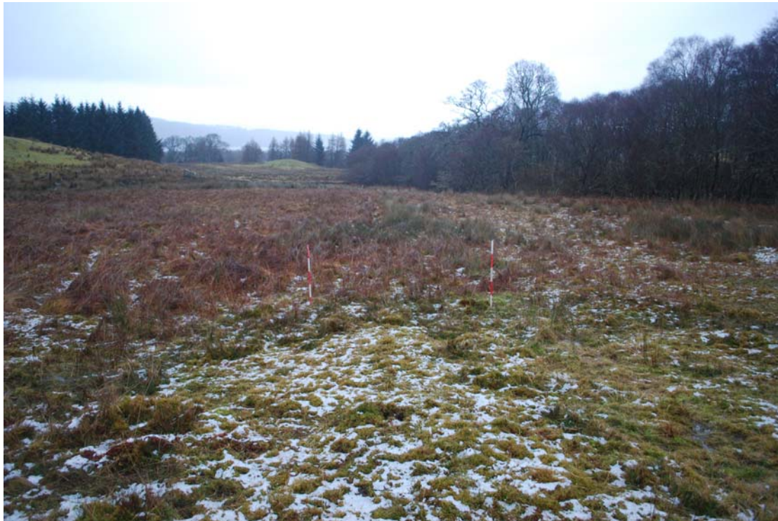
Site 7 the disused track way viewed to the north running towards the canalised burn Site 5 and the proposed pipe route crossing over the Allt Doire nan Sobhrachan.

A disused track way leading from the glacial knoll noted above (Site 4) to the canalised burn Site 5. The track is covered with turf and Juncus grass and is c. 3m wide and stands up to 0.20m high above the surrounding ground surface. It is aligned N-S at 16°. There may be traces of rig and furrow to the west side of it but this was not entirely convincing under the survey conditions but further inspection will take place in this area during the watching brief. It is recommended that the track is avoided by the pipe route and a watching brief is maintained to ensure the track is avoided.