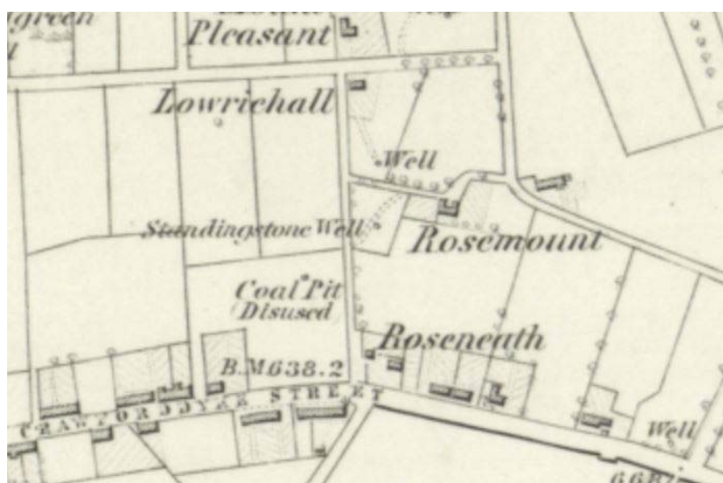
Figure 2: Extract from 1 st Edition Ordnance Survey, 1859