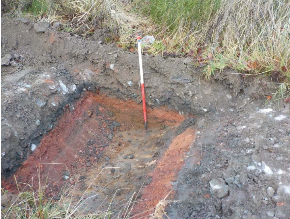
Plate 3: General view of Trench 8 - S-facing section