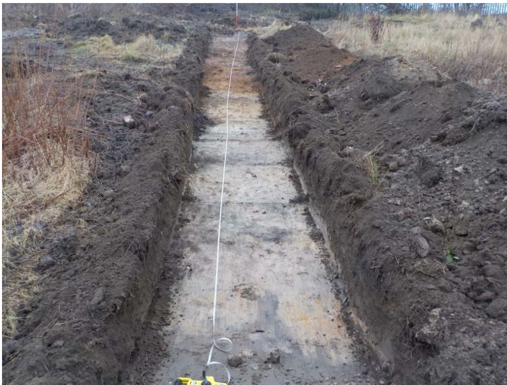
Plate 2: General view of Trench 4