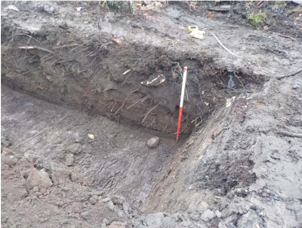
Plate 1: General view of Trench 2 - E-facing section

it was used for a construction site compound, most likely related to the new school to the immediate east.