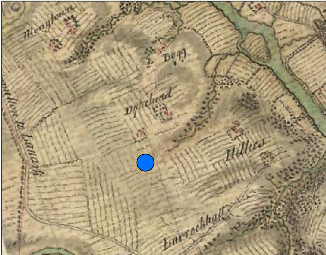
Plate 1: Roy's Military Survey 1747 - 52 (blue dot at approximate location of Site)