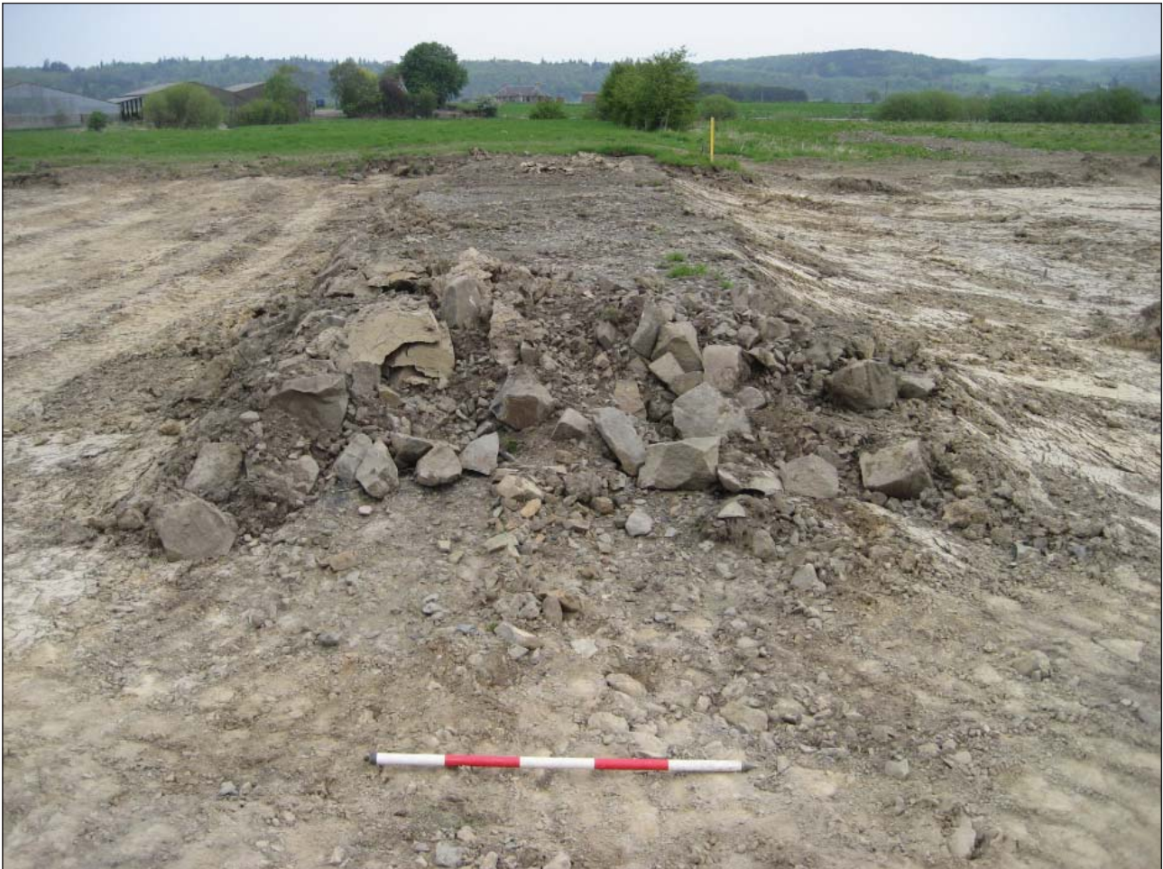
Illus 2 Road (003) looking north-east

The Council planning condition stated that developer should provide access at all reasonable times to