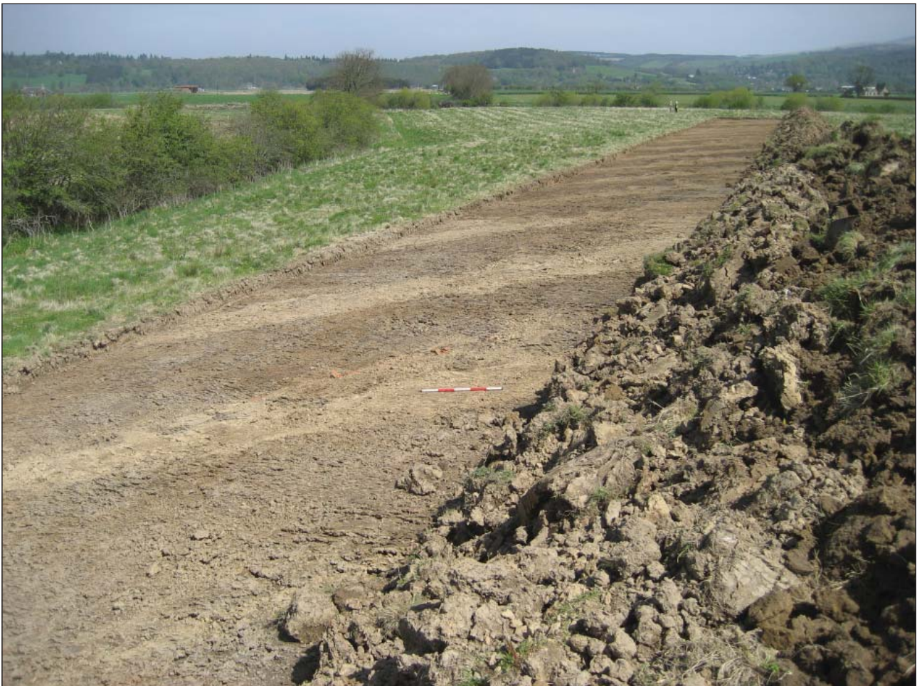
Illus 3 Cultivation furrows looking north

Two sets of closely spaced cultivation furrow remains were evident across the site (Illus 3). To the north-west of a stream and field boundary the cultivation remains were orientated south-west to north-east. The width of the ridge varied between 2.1m and 2.4m and the spacing between the ridges (measured from centre of ridge to centre of next ridge) was approximately 7m. To the south-east of the stream and field boundary the cultivation furrow remains were