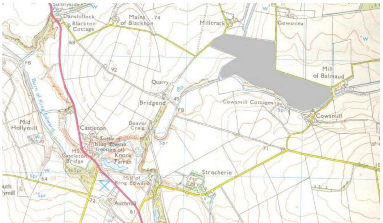
Illus 2 Location of site (shaded grey).