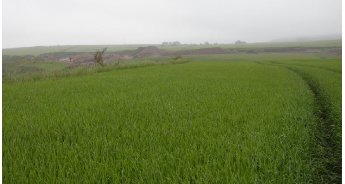
Illus 1 Looking W across field 2 to the existing quarry