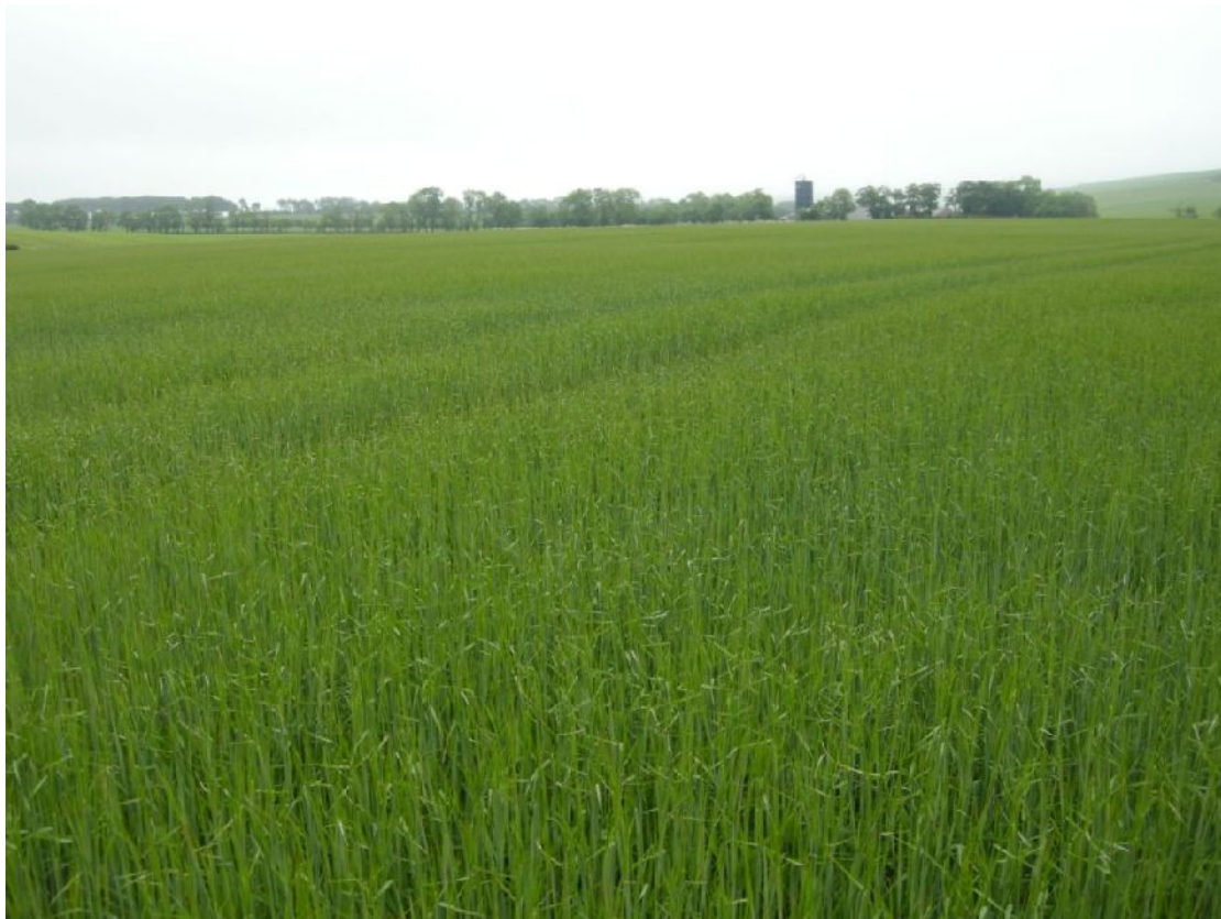
Illus 3 Looking E across field 1 towards Mill of Balmaud